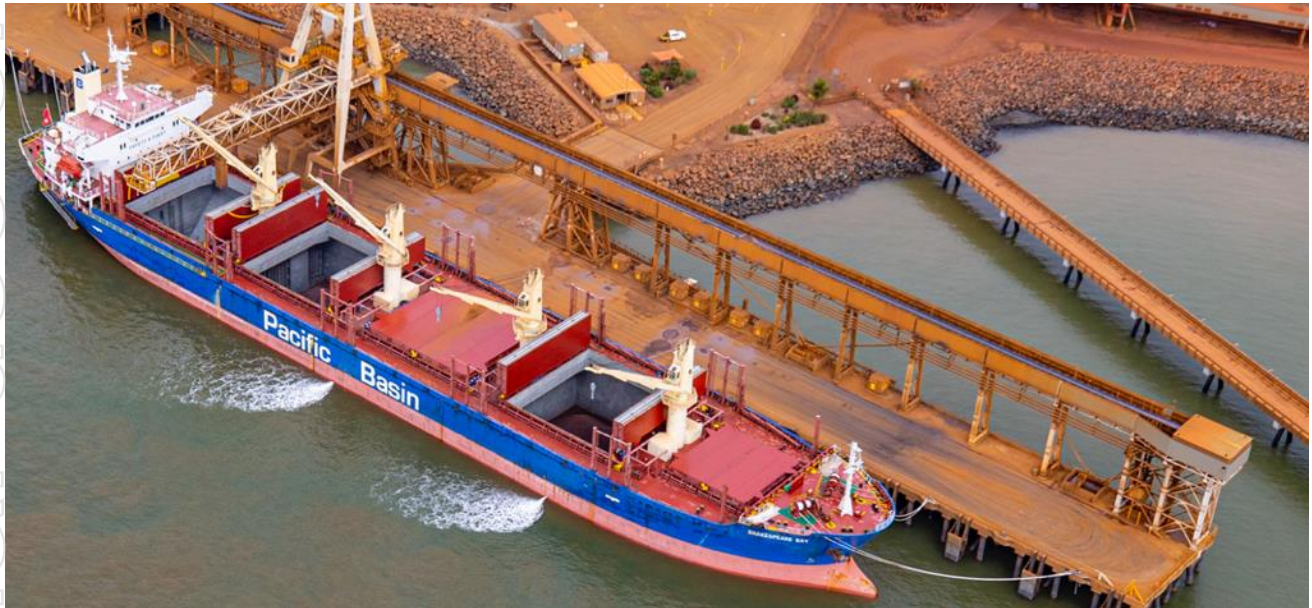
The Shakespeare Bay docked at Utah Point to load the first shipment of Butcherbird manganese ore.

In December 2021, E25 completed its third shipment of 41,000 tonnes of high-quality manganese concentrate departed Utah Point, Port Hedland for delivery to offtake partner OMH. The Company's third ore shipment left on board the bulk vessel MV Top Fair.