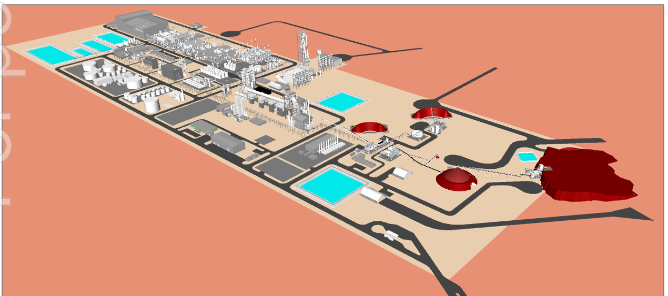
TNG's new Mount Peake Project integrated operation layout (south-east view)

The preliminary integrated layout was completed by Clough in November 2021, based on the deliverables prepared under the FEED study with SMS. The integrated plant layout comprises the Beneficiation Plant, TPF, Titanium Pigment Plant and plant utilities.