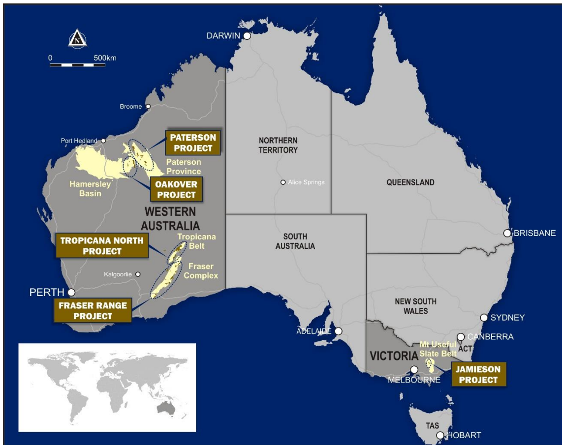
Figure 1: Location of Carawine's Projects throughout Australia.

Carawine has five gold, copper and base metal exploration projects, targeting high value deposits in highly prospective, active mineral provinces in Western Australia and Victoria (Figure 1). Part of Carawine's assets located in Western Australia are held by its wholly owned subsidiary, Phantom Resources Pty Ltd.