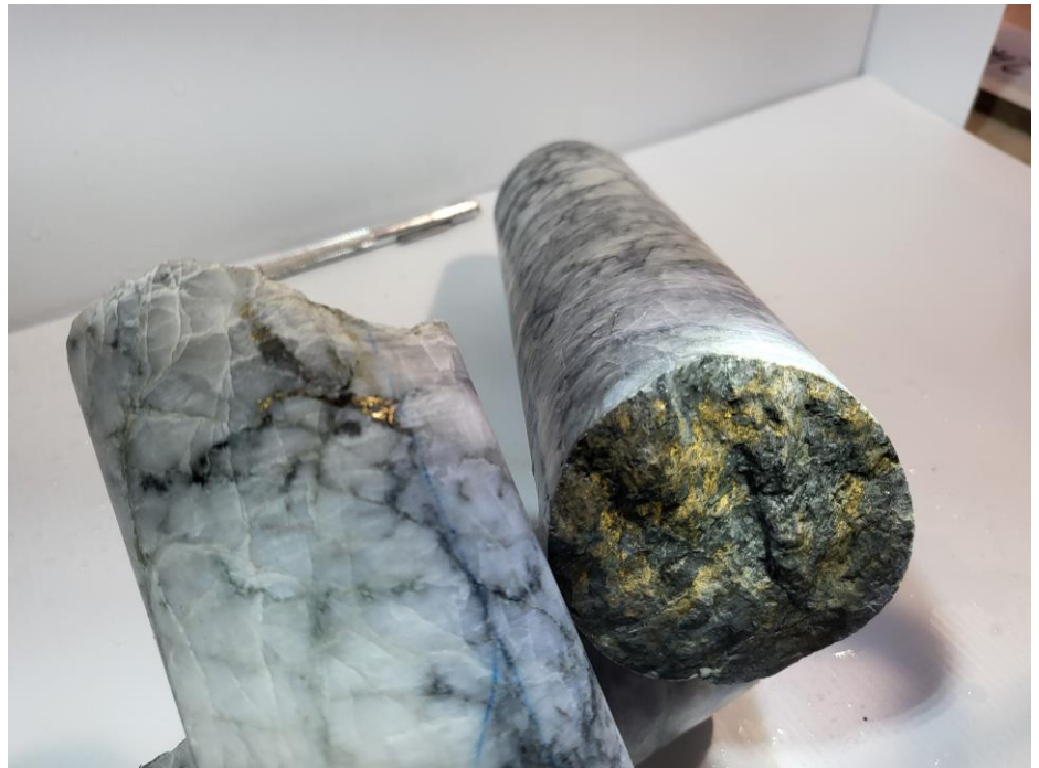
Figure 1. Significant Visible gold in Alexander drillhole AX84 quartz reef.