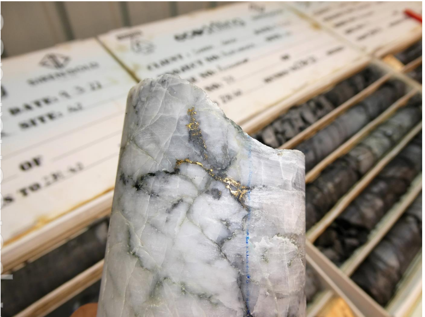
Figure 2. Significant Visible gold in Alexander River drillhole AX84 quartz reef in the McVicar West shoot.