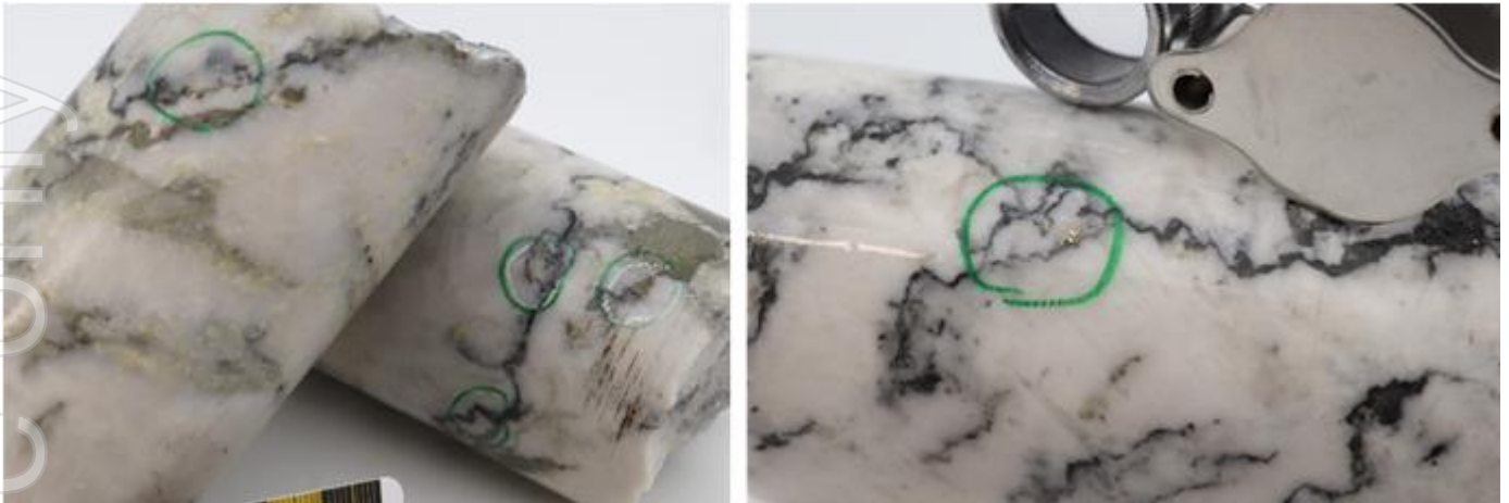
Figure 3. Photos - New Found Gold Corp's Queensway Project - Epizonal gold mineralisation in NFGC-21-195 and NFGC-21-202, Canada (from 9 March 2022 press release).