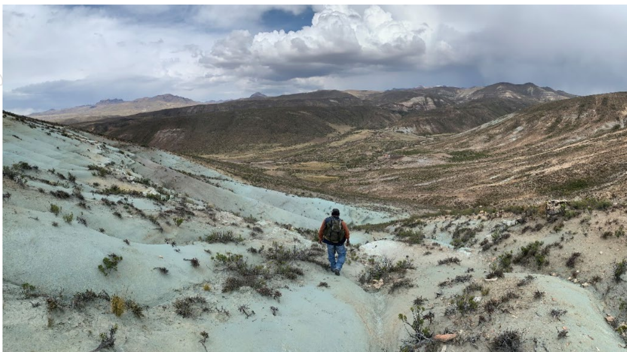
Figure 2: Picha Project – Fundicion target area

Valor Resources Limited (“Valor” or the “Company”) is pleased to announce the final results of the Induced Polarisation (IP) and ground magnetic survey completed at the Picha Project in late 2021. The IP survey comprised 57-line km and the ground magnetic survey was 204 line km covering most of the area of the granted mining concessions. This data has been integrated with geological mapping to develop a 3D-geological model which, along with the surface geochemical sampling, is being used to determine targets and drill hole locations.