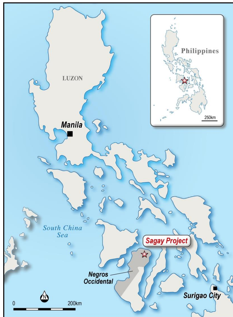
Figure 1: Location of the Sagay Project in the province of Negros Occidental, Philippines.