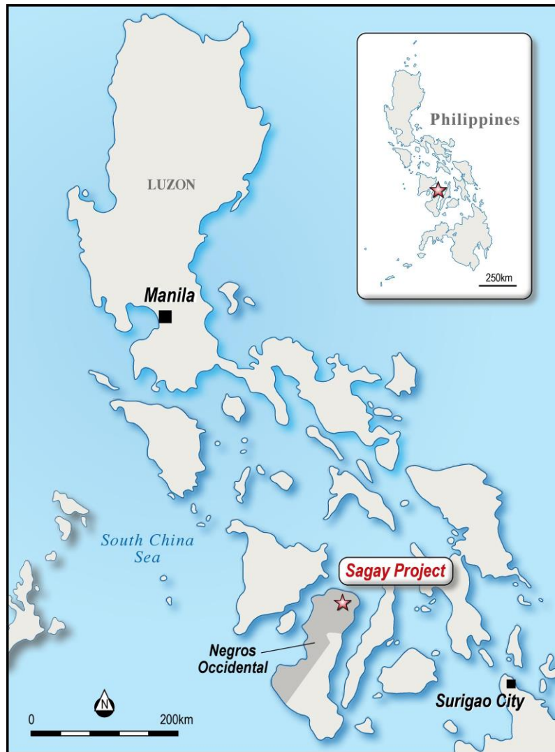
Figure 1: Location of the Sagay Project in the province of Negros Occidental, Philippines.