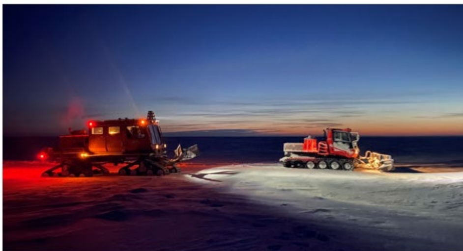
Figure 1. Snow road construction for Merlin-2

“Following a period of review we are pleased to have the PTD in hand, and the mobilisation of the Arctic Fox rig commencing to the drilling location ahead of spud in early March 2022. We look forward with excitement to the drilling of the highly anticipated Merlin-2 appraisal well.”