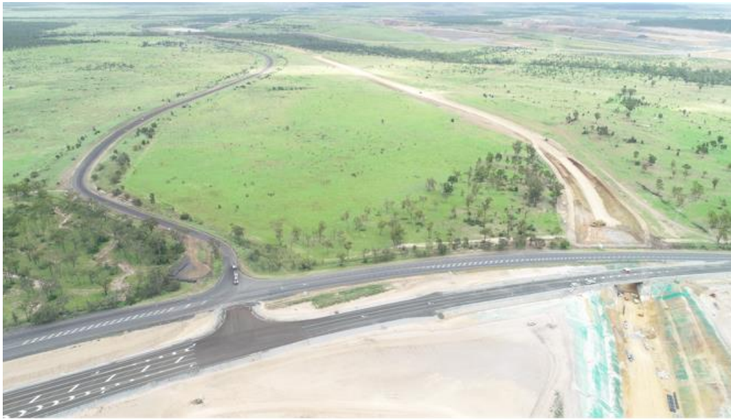
Figure 1: Construction of the new Isaac Plains intersection and underpass bridge next to the Peak Downs Highway – looking north towards Isaac Plains

Rain during the quarter had some impact on the construction activities causing delays, however works continued and project construction will be substantially completed for the major packages before dragline operations are transferred to Isaac Downs.