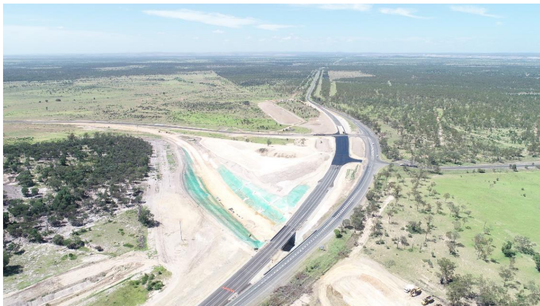
Figure 2: Peak Downs Highway deviation looking west toward Moranbah, Isaac Downs haul road on the left