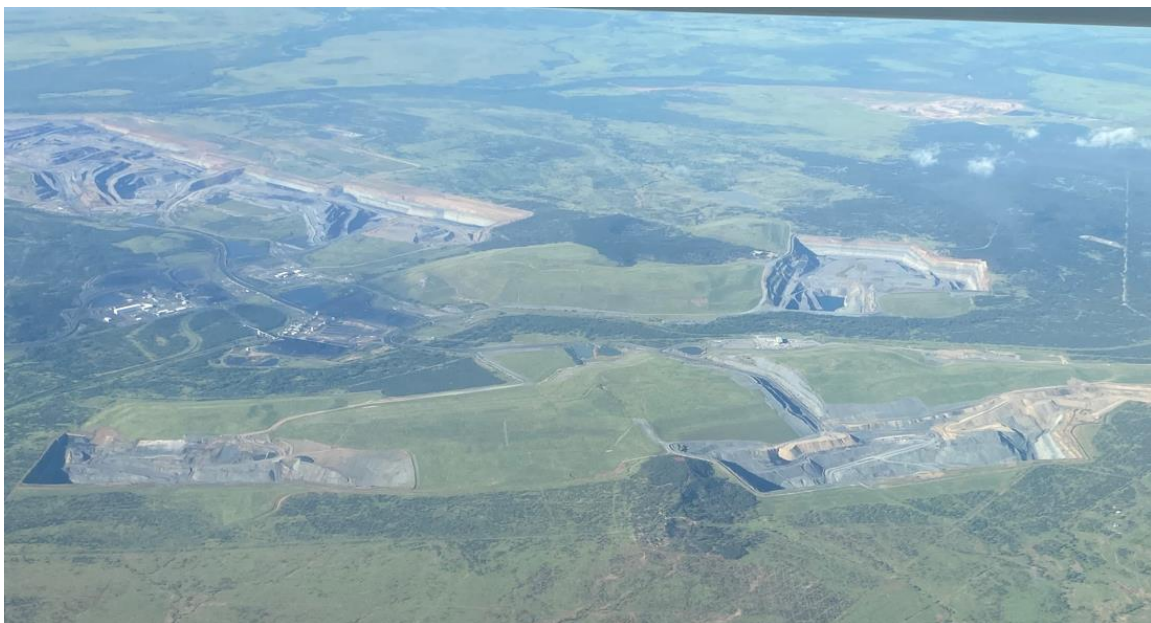
Figure 4: Millennium Mine in the foreground showing rehabilitation benefiting from recent rain, and Poitrel Mine in the top left, with Isaac Downs Mine top right in the far background

During the quarter, toll washing at the Red Mountain Infrastructure Coal Preparation Plant commenced with 54kt of saleable coal produced. The first shipment of coal from the mine occurred during the quarter with 22kt of PCI coal shipped to a customer in Japan. ROM coal production for the quarter was 135kt. All figures are on a 100% basis. Stanmore's share is 50% through the ownership of MetRes Pty Ltd. Note that MetRes Pty Ltd financial performance and physical metrics are not consolidated into Stanmore resources results for accounting purposes.