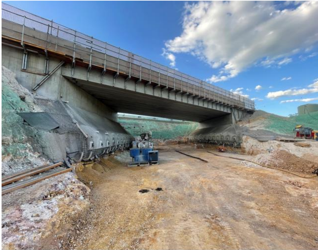
Figure 3: Construction of the concrete underpass bridge next to the Peak Downs Highway