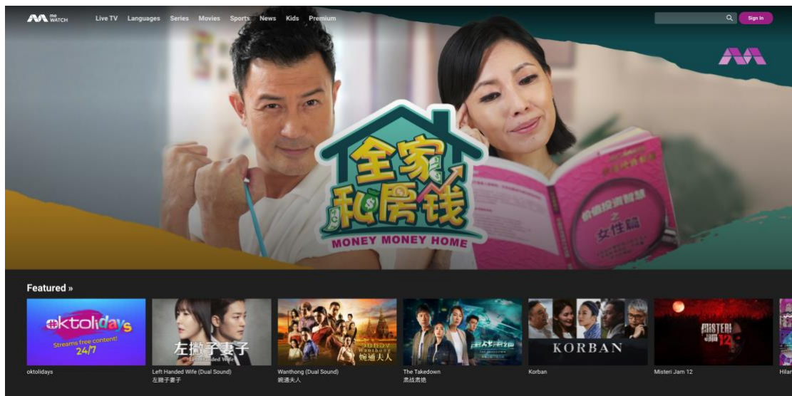
Figure 4. Money Money Home series featured on MeWatch