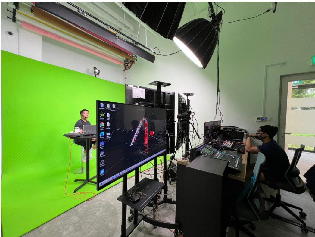
Figure 3. Recording studio with green screen