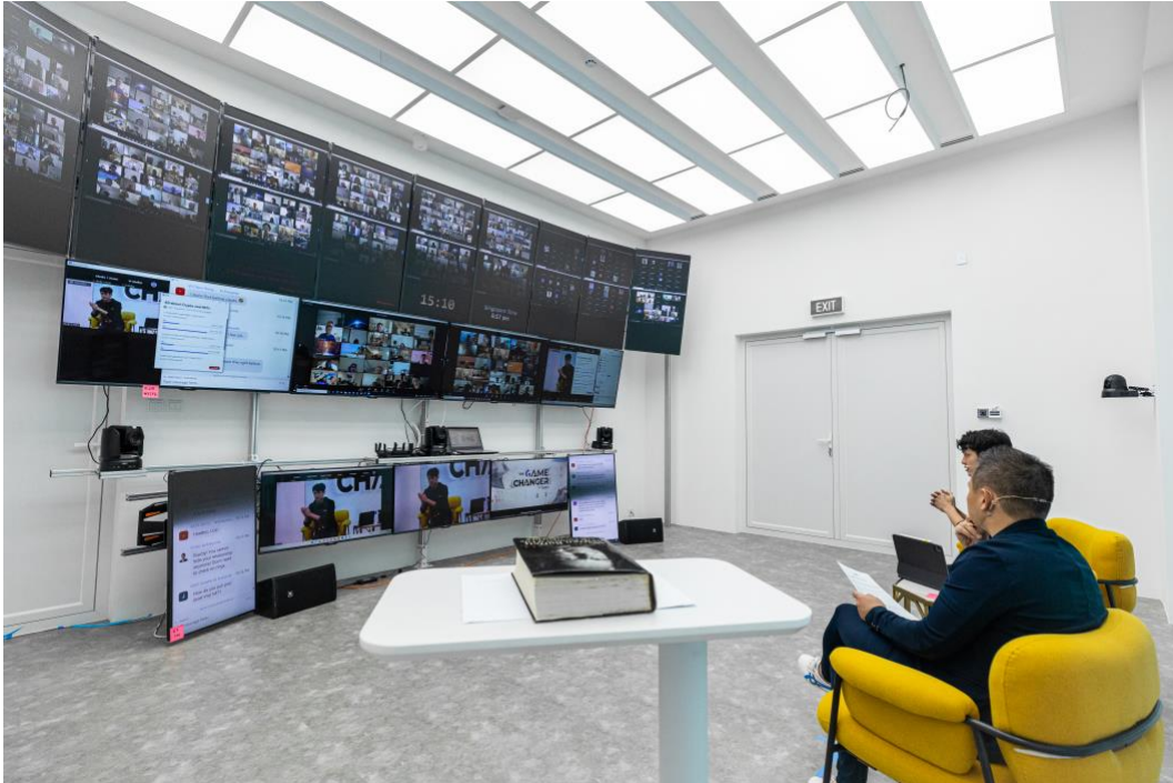
Figure 2. Broadcast Studio from speaker's point of view