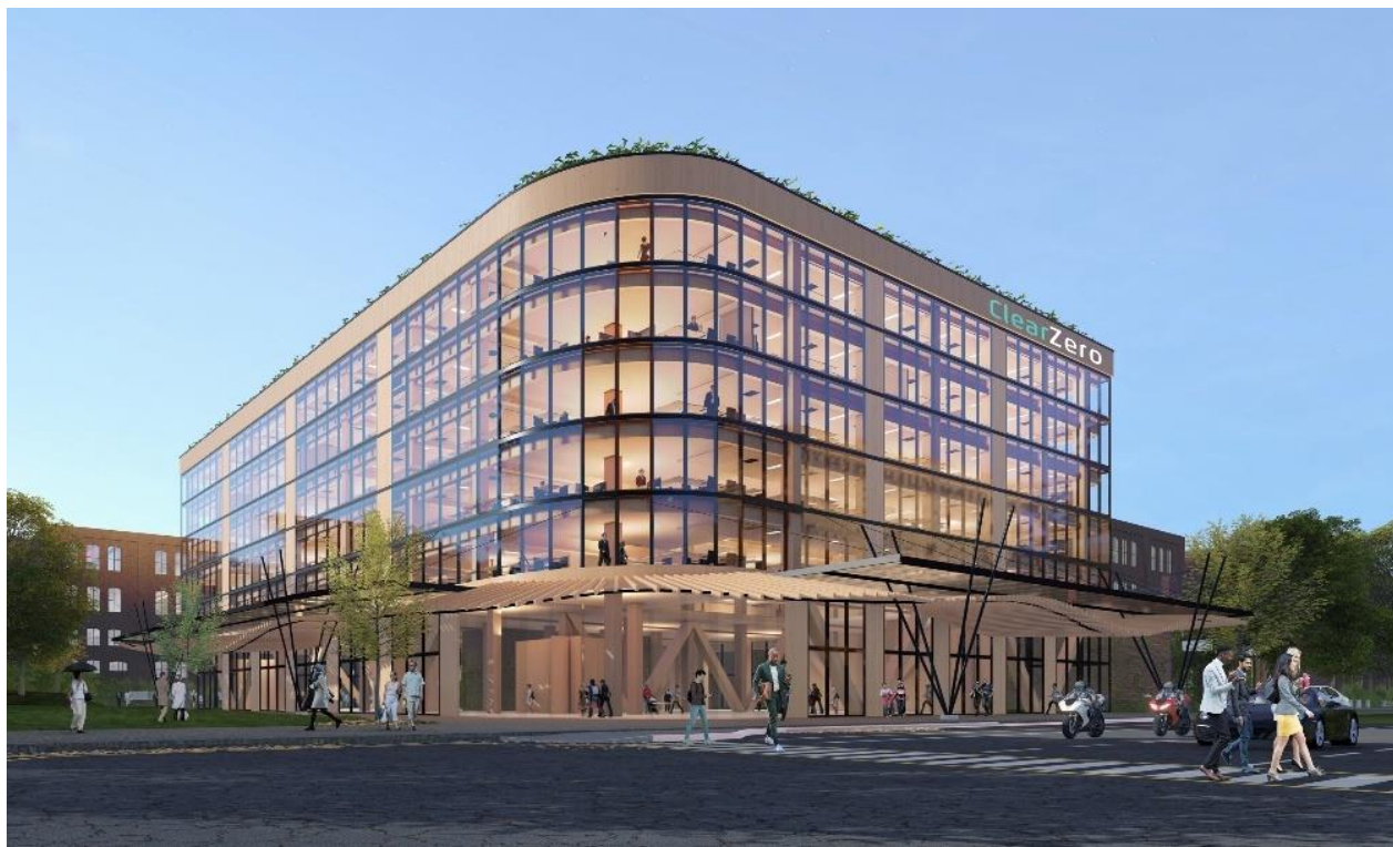
Artists impression of ClearZero Archetype (front view).

Integral to the Archetype design was the use of ClearVue's advanced technology-based building integrated photovoltaic glazing solution across the total building design, and as the primary façade material for the Archetype, including the use of higher glazing to wall ratios on the facades with higher solar exposure.