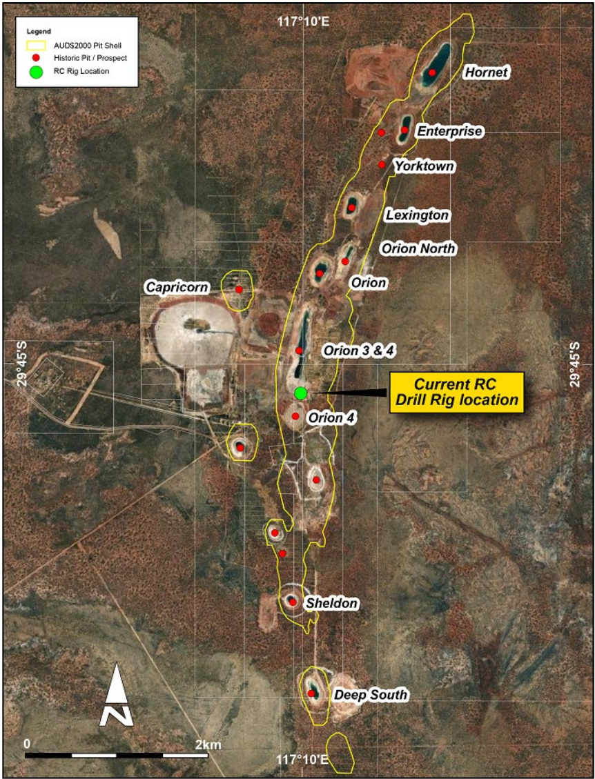
Resource shells, historical pits and current drilling location

Drilling has commenced in the area of the historical Orion 3 and 4 pits.