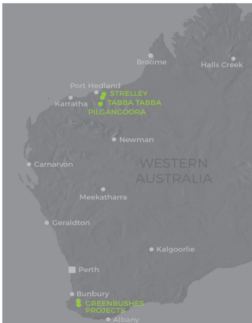
Figure 1: Location of LPI's properties in the Pilbara and SW regions of Western Australia; work recently completed at Greenbushes Project and at Pilgangoora