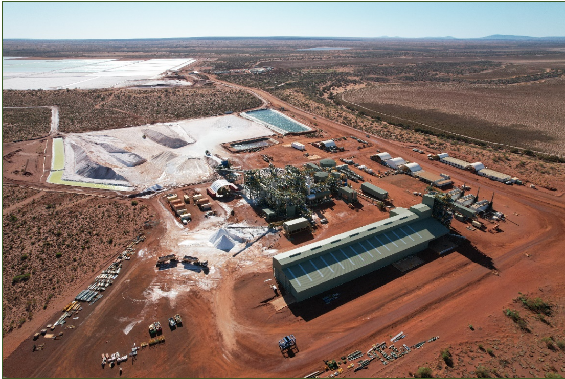
BSOPP Evaporation Ponds and Purification Plant

The Company has been issued its Operating Licence by the Western Australian Department of Water and Environmental Regulation ( DWER ), allowing commercial operation at the BSOPP.