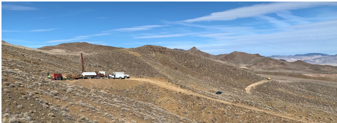
Figure 1: Diamond drilling rig at Douglas Canyon, Nevada

Drilling at DCD 02 has successfully intersected a silica matrix brecciated quartz vein close to the current depth of the hole, which is approximately 213.5m (700.5ft) ( Figure 2 ). Intersecting the targeted structure in the first hole validates Oar’s exploration model at the Douglas Canyon Project and is viewed as a very encouraging initial outcome.