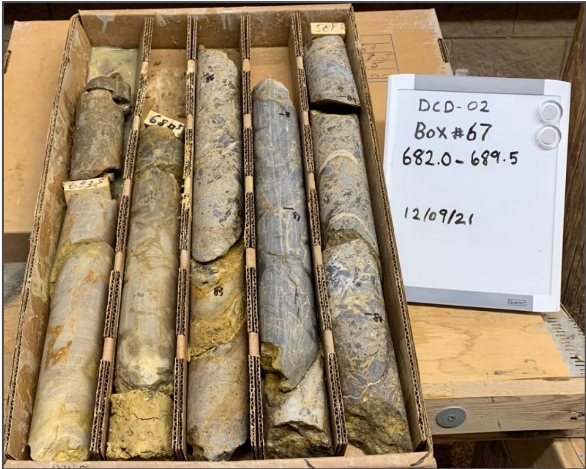
Figure 2: Drill core from Douglas Canyon Project showing silica matrix brecciated quartz veining

A total of 175 individual core samples have already been delivered to the laboratory in Reno for analysis, with results anticipated to be returned early in the new year. Results will be released as they become available.