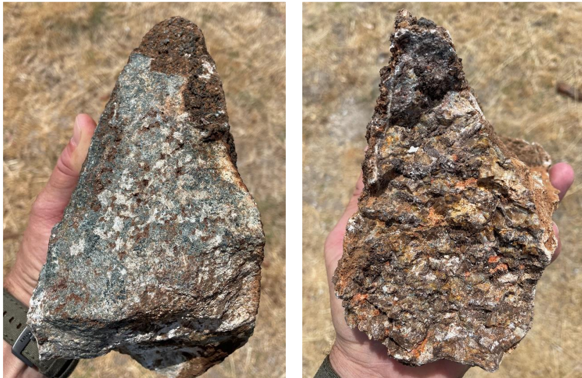
Figure 2: Carbonatite samples from Kingfisher and Kingfisher South.

Outcropping carbonatites were identified from rocks collected during the helicopter supported sighter sampling program. The sighter samples were then combined with the geology and geophysics to identify additional potential locations for carbonatites. Follow-up mapping has been completed, with outcropping carbonatites being identified by Kingfisher's geologists at more than 20 field sites (Figure 2).