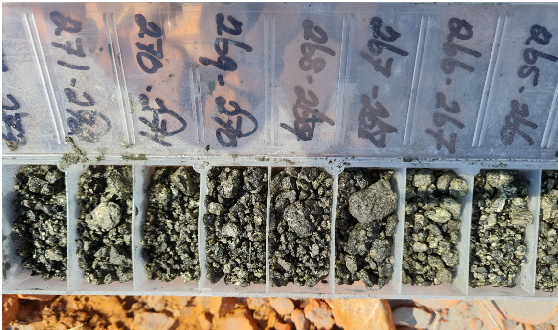
Figure 3. Photo of RC drill chips from NLDD044 showing intervals of semi massive copper sulphide mineralisation.