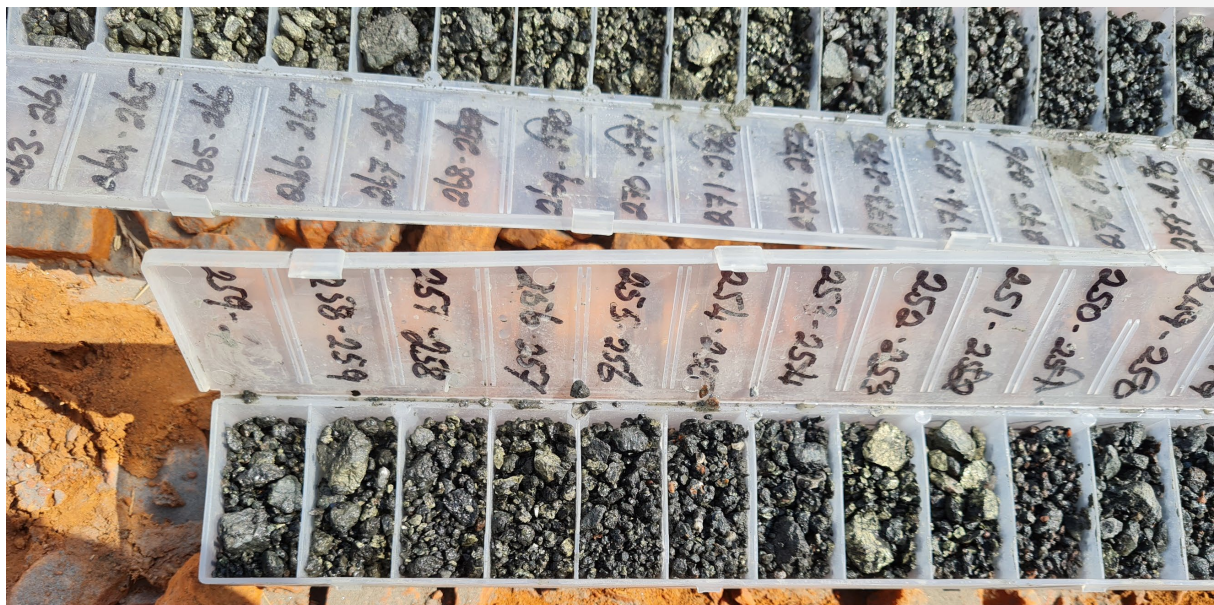
Figure 4. Photo of RC drill chips from NLDD044 showing intervals of semi massive copper sulphide mineralisation.