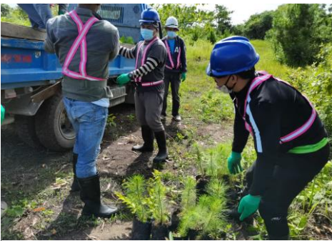
Image 5. Delivery of Bengue Pine Tree seedlings by MMCI prior to planting at the NGP Site in Kalinga Province.

Rehabilitation of drill sites at MCB 033 and MCB 034 have been completed while MCB-036 is currently ongoing. Environmental Baseline Studies are in their final stage for completion. Outcomes of the studies will inform both the Environmental Impact Assessment (EIS) permitting process the DMPF permitting process.