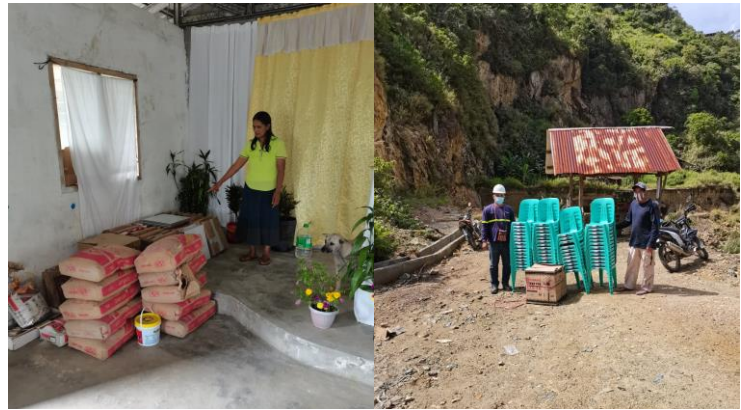
Image 4. Supplies and materials provided by MMCI to local church groups in Brgy, Balatoc, Pasil, Kalinga.

Building supplies, furniture and fixtures were also distributed to a number of local religious groups in the community by providing supplies and materials for the improvement of church facilities which includes tiles, cement, chairs, fans, roofing materials and others. This is in response to their request to assist in improving their church facilities in order to improve church attendance and promote lasting peace and harmony in the community.