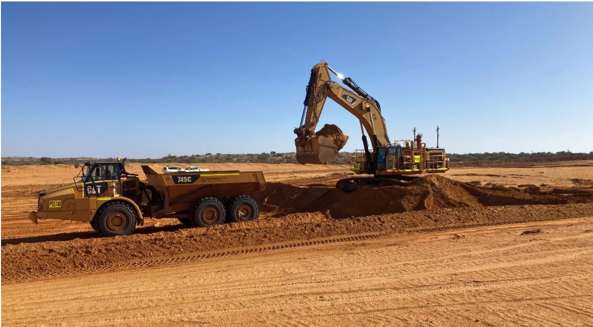
Figure 2 – Ambassador North pit ramp looking north

Excavation of the Ambassador North pit ramp has now commenced.