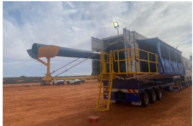
Figure 4 – PPS Extruder First HDPE pipe extruded at Ambassador (8 December 2021)