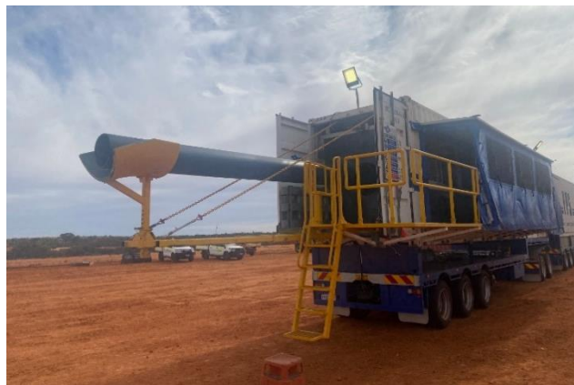
Figure 4 – PPS Extruder First HDPE pipe extruded at Ambassador (8 December 2021)