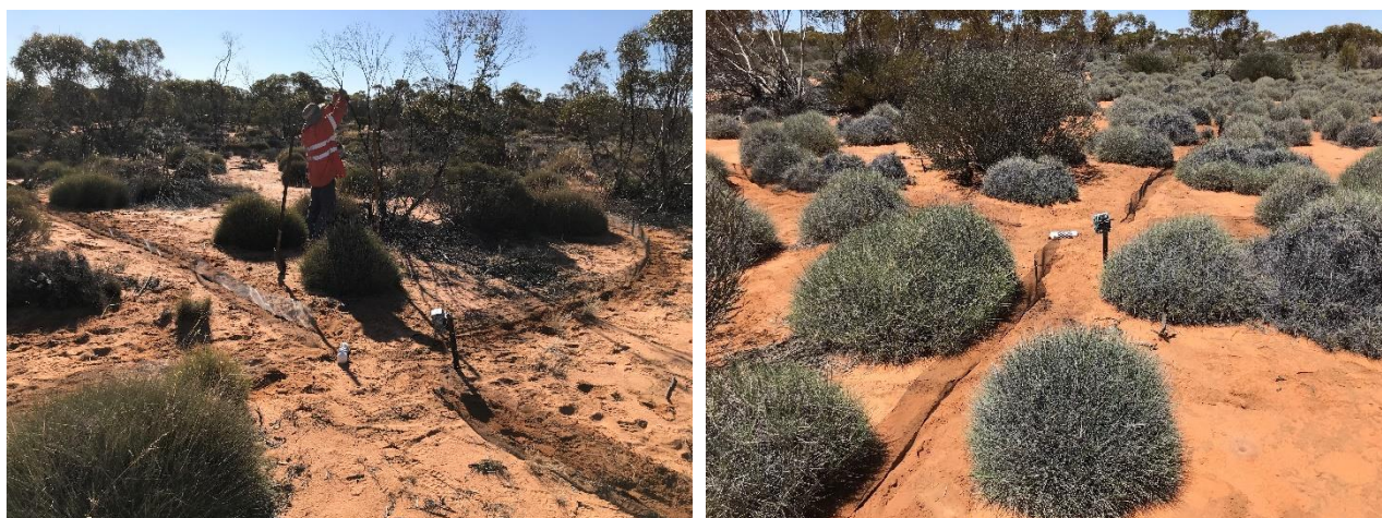
Figure 7 – Example of camera trap layout (November 2021)