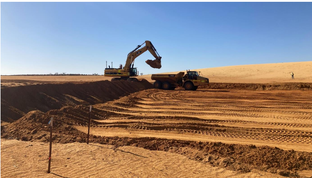
Figure 3 – Ambassador North pit ramp looking south