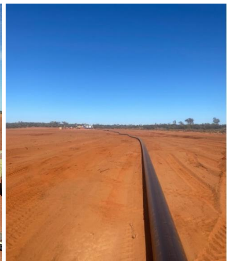
Figures 5 – HDPE pipe extruded at Ambassador (9 December 2021)