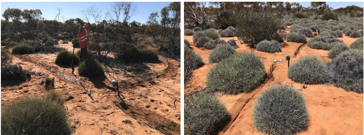
Figure 7 – Example of camera trap layout (November 2021, photographs courtesy of GHD Group)