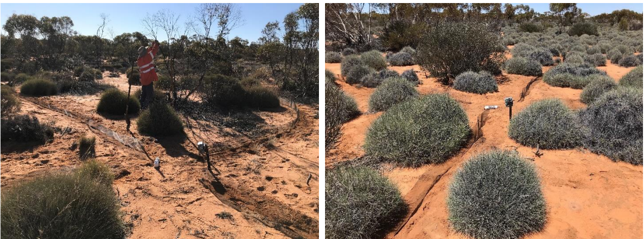
Figure 7 – Example of camera trap layout (November 2021, photographs courtesy of GHD Group)