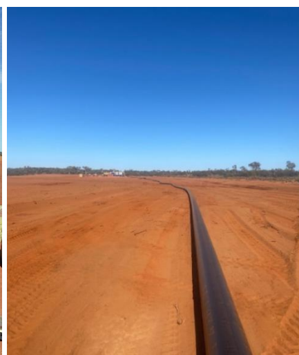
Figures 5 – HDPE pipe extruded at Ambassador (9 December 2021)