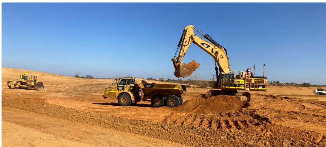
Figure 1 – Breaking ground at Ambassador North pit (11 December 2021)

The Vimy development team’s prime focus is advancing Mulga Rock to the next development milestone and in parallel our exploration team is planning to kick off exploration at our Alligator River project in the new year. These are exciting times for Vimy and new appointments to our team will be announced soon to increase our capacity to deliver value to our shareholders.”