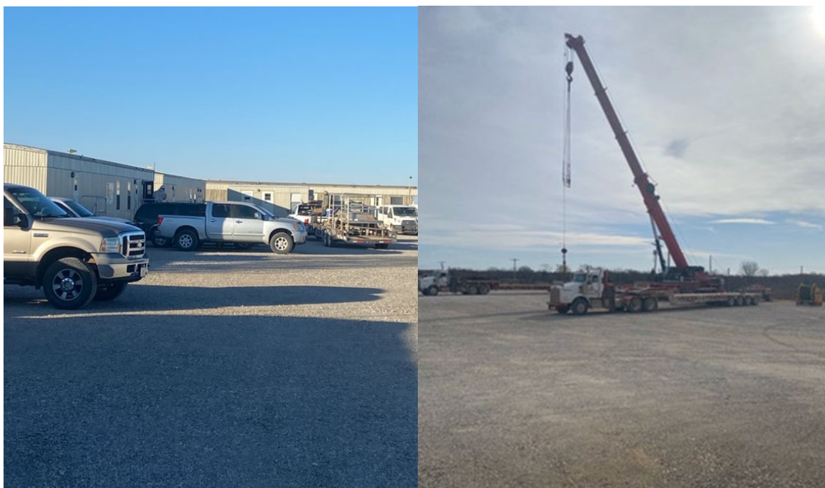
Figure 2: Rangers Well, Stephens County, Oklahoma, Equipment arriving on location