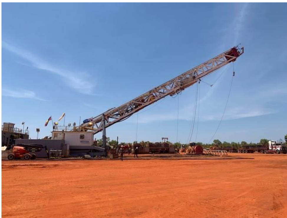
Ensign 963 mast lowering for move to Ungani 8