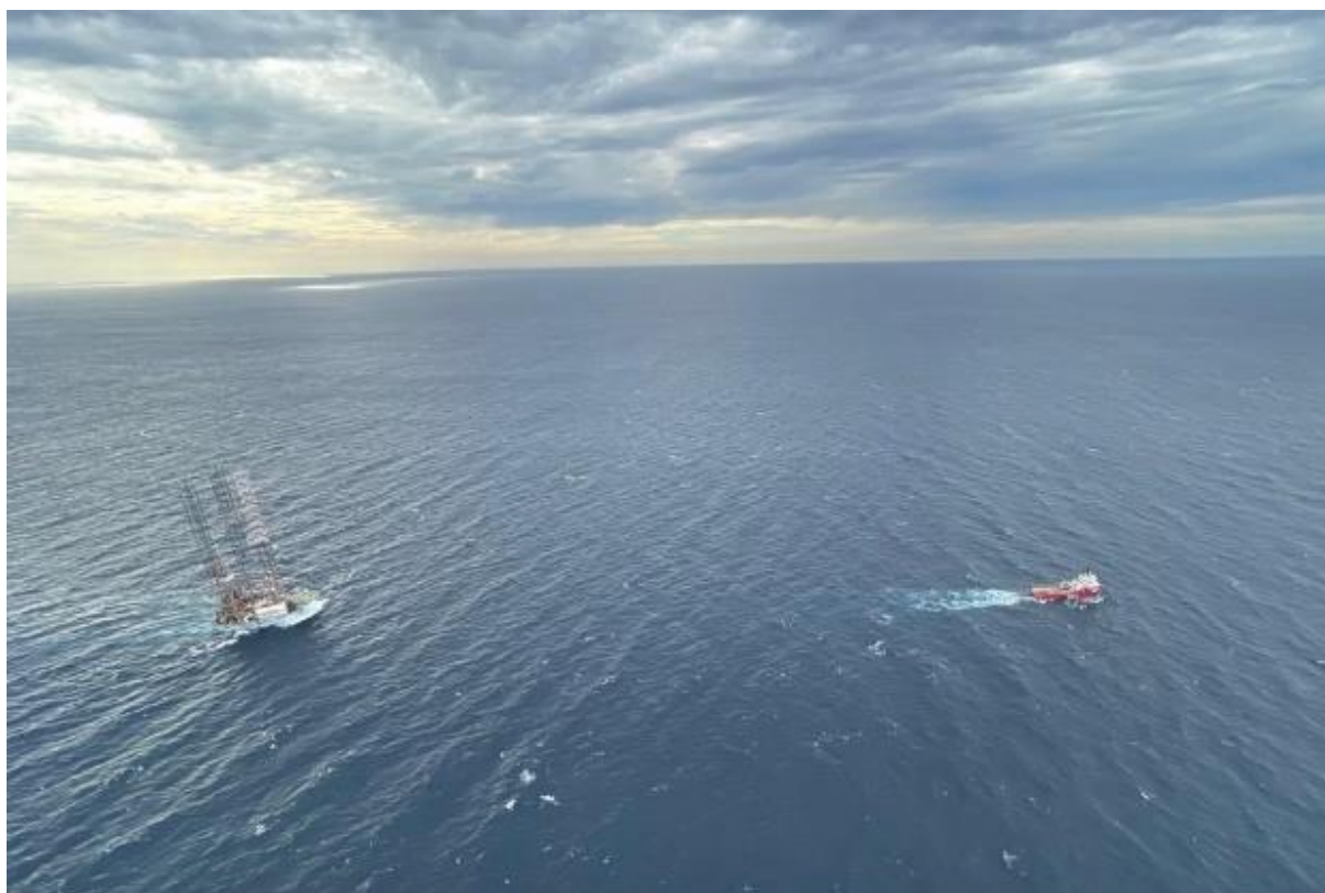
Image of the VALARIS JU-107 drilling rig

We will provide updates as drilling progresses and I look forward to being able to share the Buffalo-10 well results with our shareholders early in the new year."