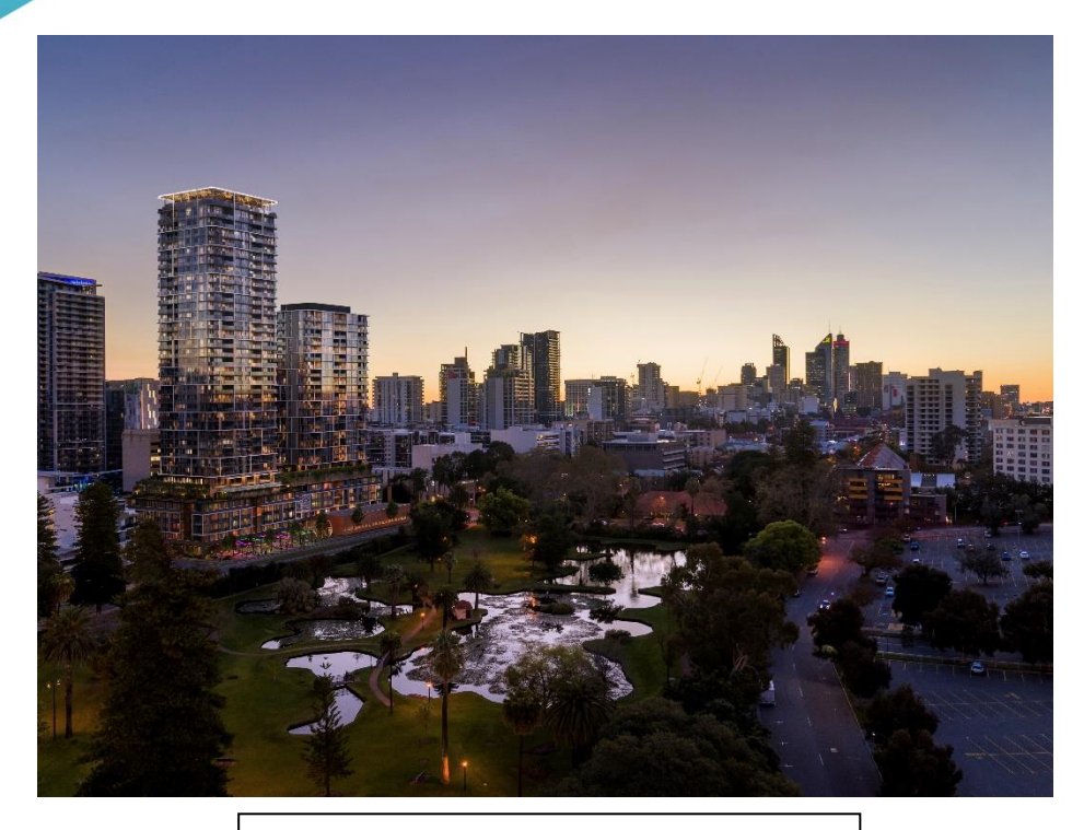
ABOVE: Garden Towers – looking West