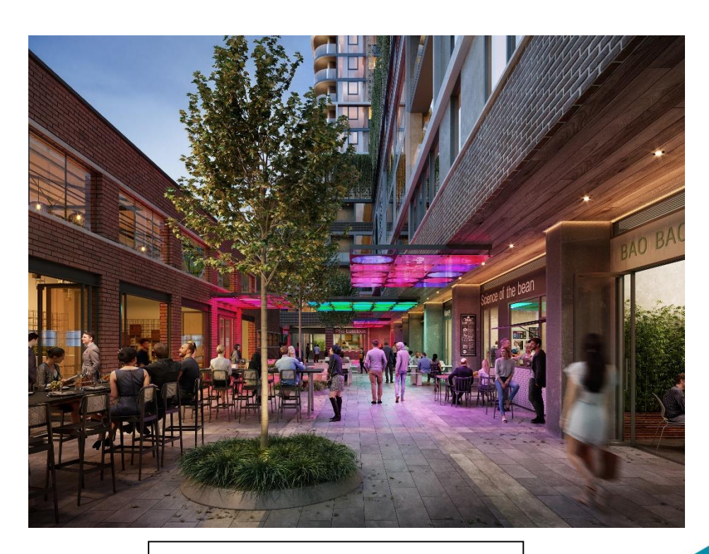
ABOVE: Garden Towers - mall