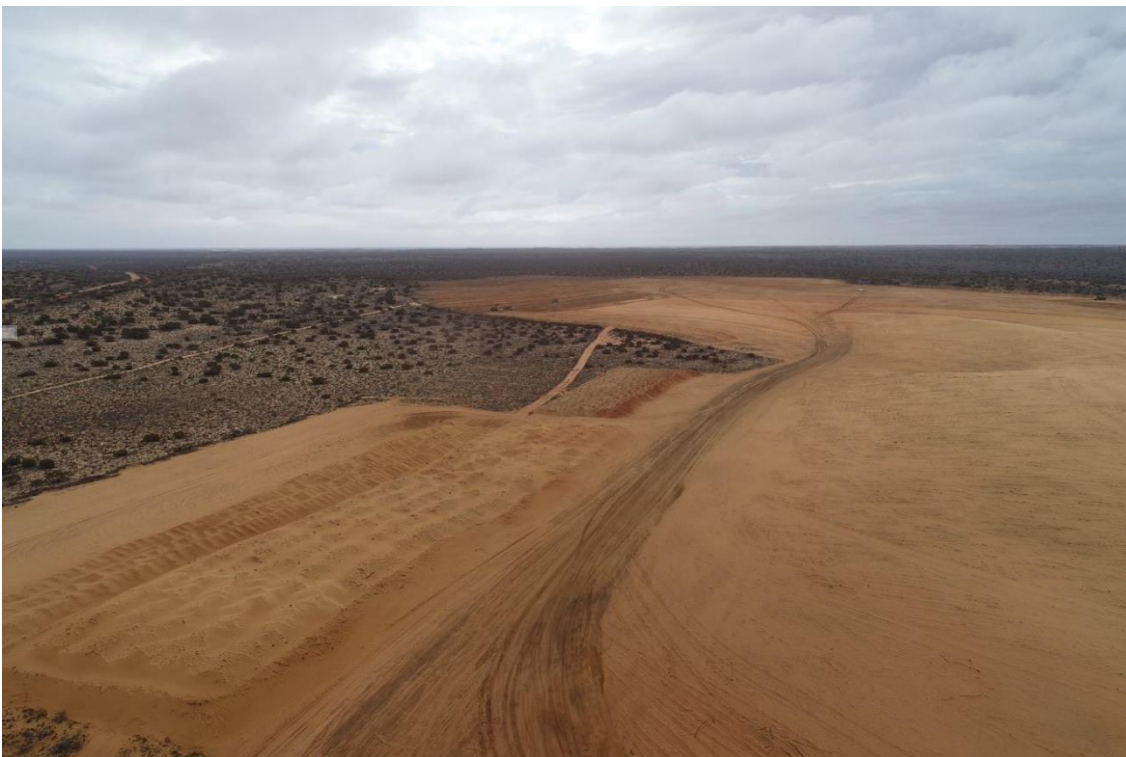
Figure 2 – Topsoil stockpiles at Ambassador North looking east (18 November 2021)