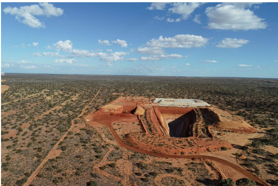
Figure 8 – Ambassador East GIT facing northwest (23 November 2021)