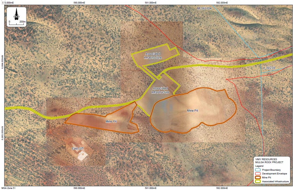
Figure 1 – Mulga Rock East (18 November 2021)