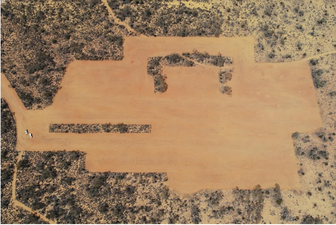
Figure 7 – Topsoil and subsoil removal at the Accommodation Village (24 November 2021)