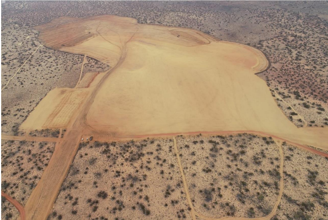
Figure 3 – Ambassador North looking east (18 November 2021)