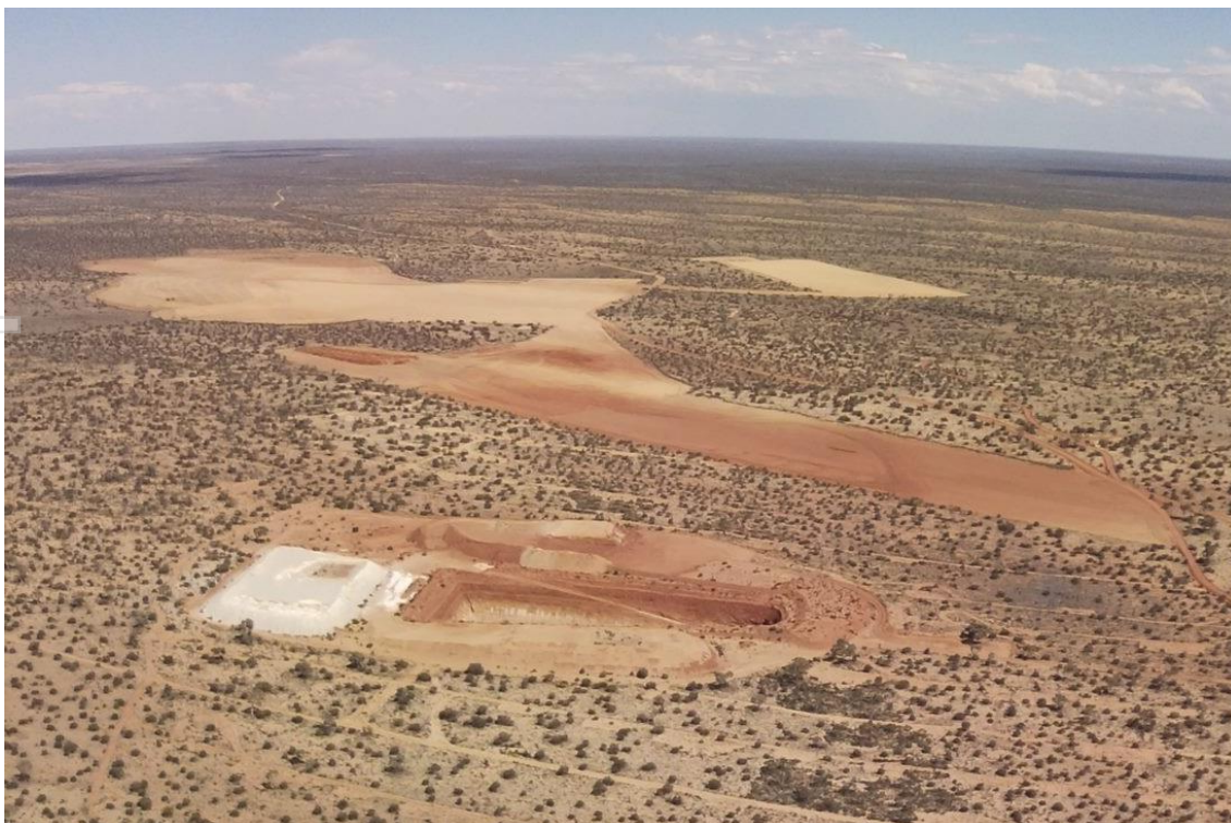
Figure 4 – Ambassador North and Ambassador East GIT looking north east (17 November 2021)