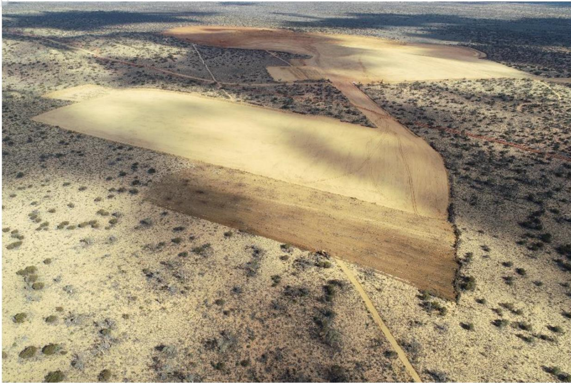
Figure 5 – Vegetation clearing at the Ambassador North extension (23 November 2021)