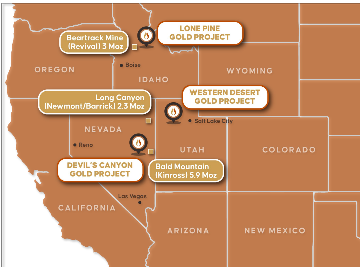
Figure 1 - Diablo Resources, United States of America (USA) project portfolio, located in the mining friendly states of Utah, Nevada and Idaho.

Diablo Resources Ltd (ASX: DBO) is pleased to update the market on exploration activities at its three USA Projects, located in some of the most prospective gold and base-metal regions globally.