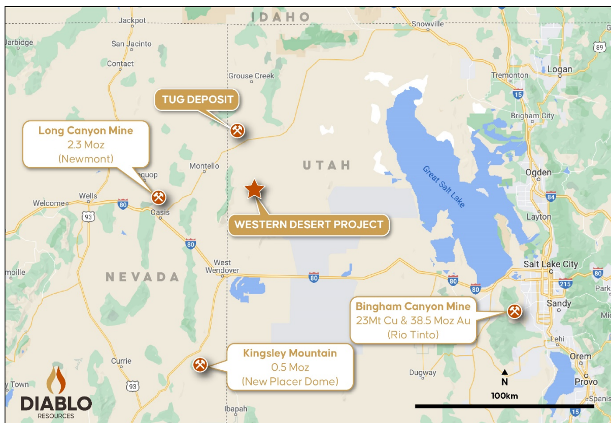
Figure 2 - Diabolo Resources, Location of Western Desert Copper-Gold Project with significant regional mines and deposits 3, 4, 5, 6, 18 .