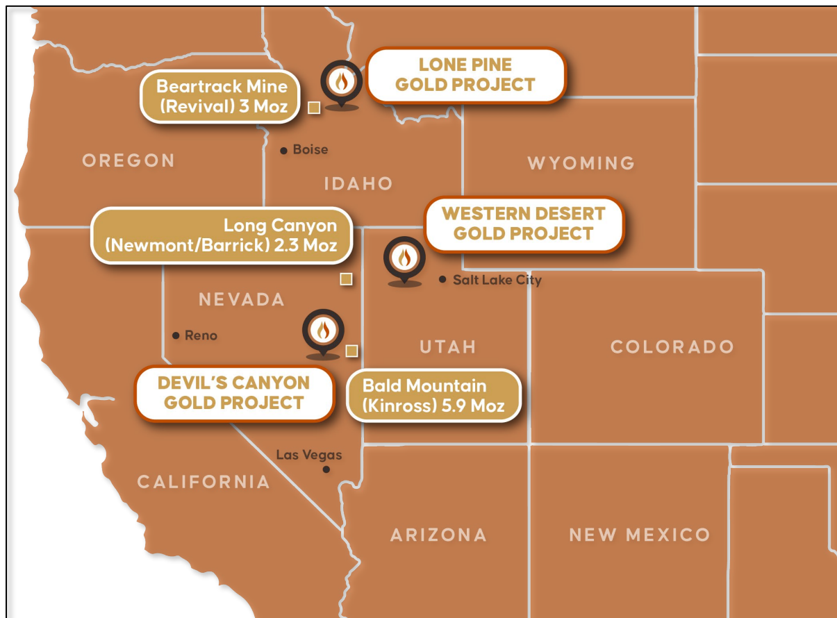
Diablo Resources, United States of America (USA) project portfolio, located in the mining friendly states of Utah, Nevada and Idaho.

Diablo is an ASX listed , USA-focused minerals exploration and development company. The mineral assets of Diablo comprise the Devil's Canyon Gold-Copper Project located in Nevada, the Western Desert Project Gold-Copper located in Utah and the Lone Pine Gold Project located in Idaho, all within the USA.