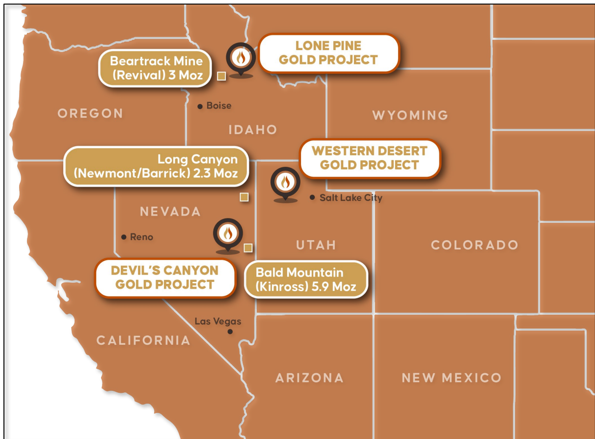
Figure 1 - Diablo Resources, United States of America (USA) project portfolio, located in the mining friendly states of Utah, Nevada and Idaho.

Diablo Resources Ltd (ASX: DBO) is pleased to update the market on exploration activities at its three USA Projects, located in some of the most prospective gold and base-metal regions globally.