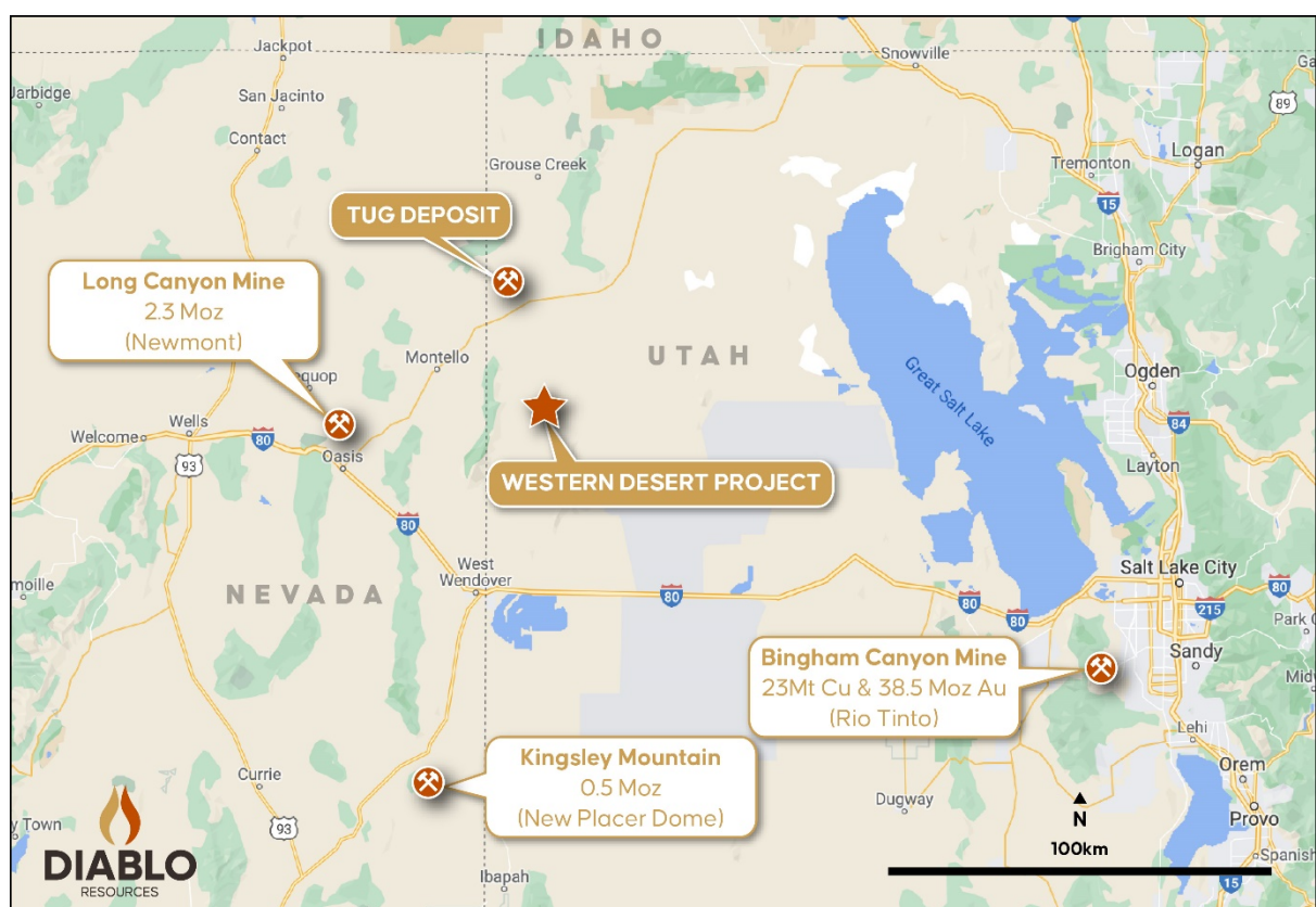
Figure 2 - Diabolo Resources, Location of Western Desert Copper-Gold Project with significant regional mines and deposits 3, 4, 5, 6, 18 .