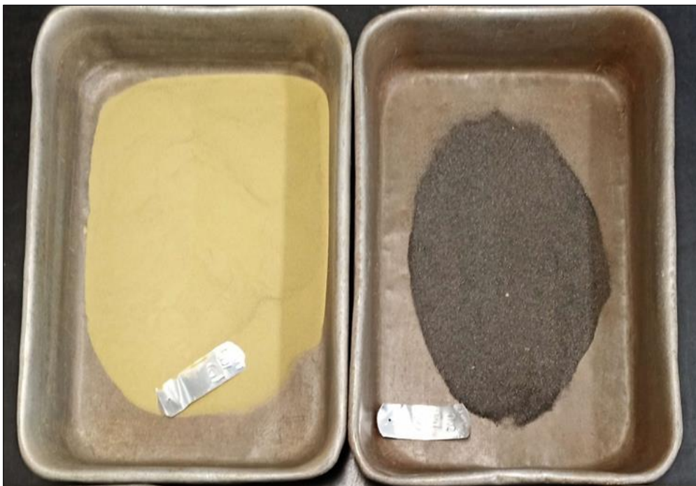
Figure 1: Rare earth (LHS) and HMC (RHS) streams from wet shaking table tests after flotation

Assays were conducted by Bureau Veritas in Perth, Australia, with standard XRF mineral sand assays used plus laser ablation / ICPMS for determination of individual rare earths.