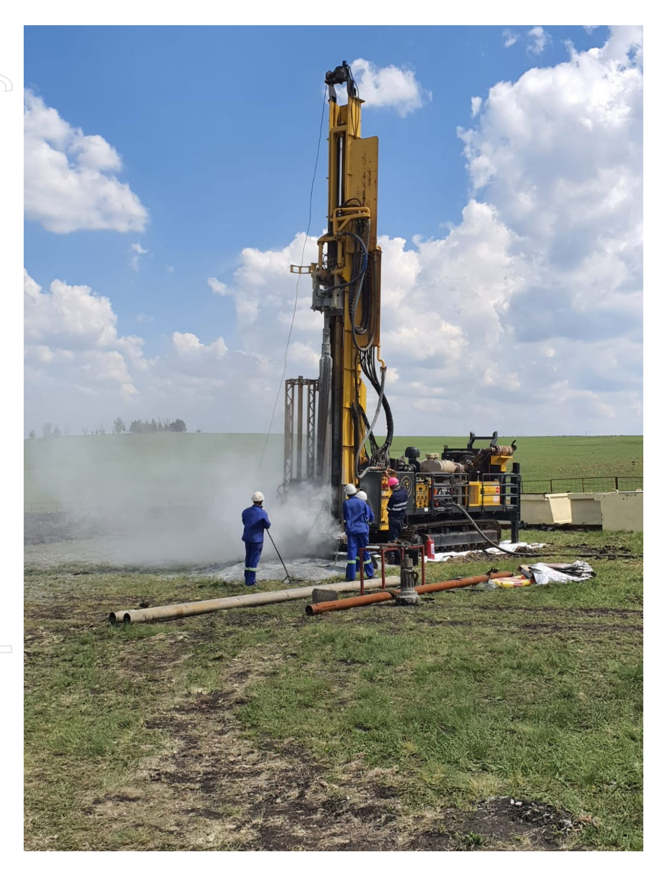
Figure 2: The B16 drilling rig spudding Korhaan-5