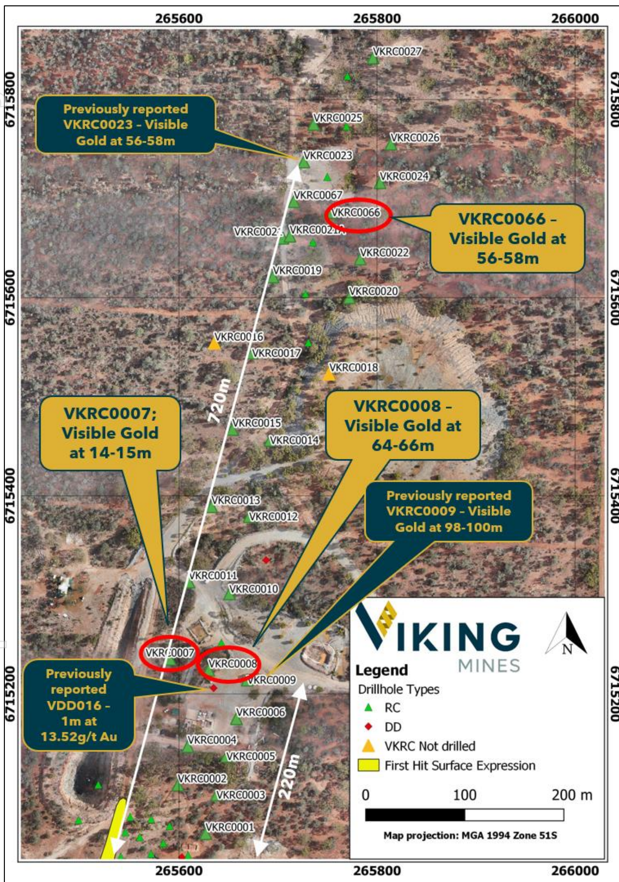
Figure 2: Map showing the location of drilled and undrilled Viking RC drillholes as part of the 2021 RC drill programme. Note location of RC holes with visible gold panned from RC chips. VKRC0007 & VKRC0008 and VKRC0066 220m north and 680m north respectively from the historic First Hit mine workings.