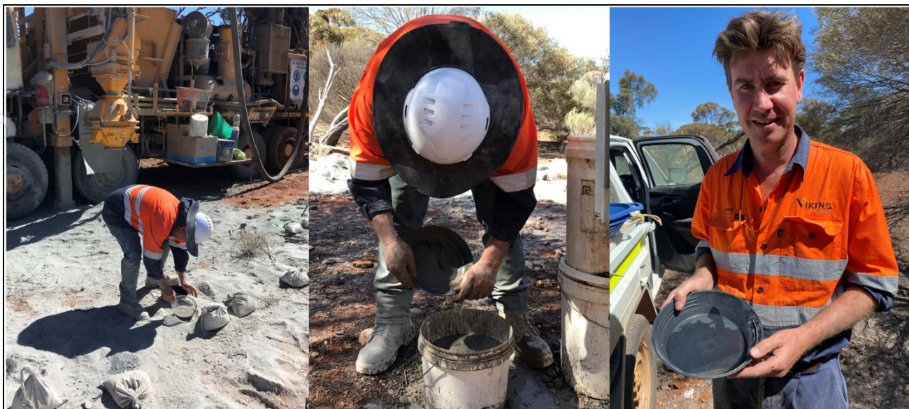
Figure 4: Viking geologists panning RC chips on hole VKRC0066.