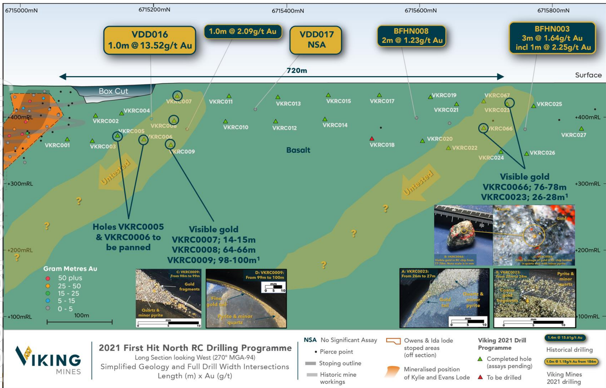
Figure 3: Long section showing location and status of RC drilling programme with completed drillholes shown and location of visible gold observed in RC drill chips. No assays have been received to date for this RC drill programme. The plunge outline of the First Hit shoot and has been superimposed over the areas where visible gold has been seen to illustrate the potential scale and orientation of shoots being explored for. This technique is used by Viking to plan drillholes and determine priorities for further investigation.