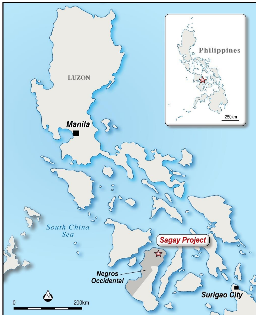
Figure 1: Location of the Sagay Project in the province of Negros Occidental, Philippines.

The areas of interest were centered on one of two prominent hills that stand out on the project area – known as Nabiga-a Hill. The Sagay Project appears to contain a very large-scale porphyry copper mineralisation at depth as defined by the numerous thick drill hole intersections as seen in the historical drilling conducted by TMCI (a wholly owned subsidiary of Freeport-McMoRan Inc., at the time), between 2008 and 2017 (see announcement of 20 April 2021).