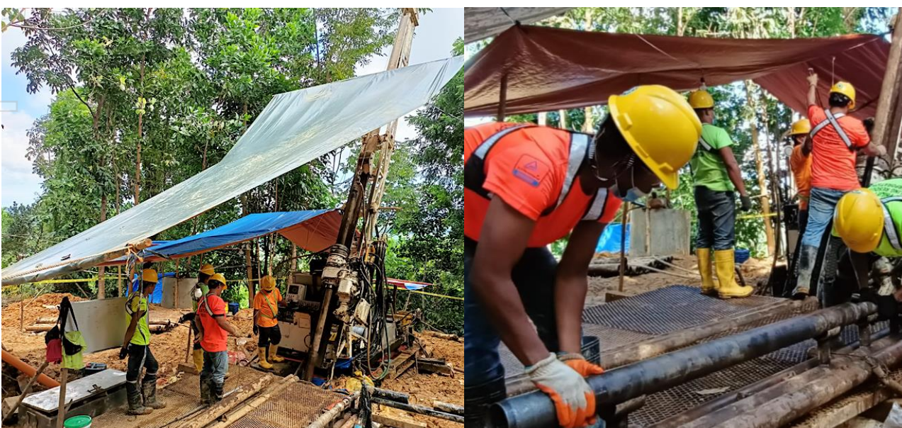
Figure 2: Drilling contractor SBF operating the diamond drill rig at the Sagay Project.