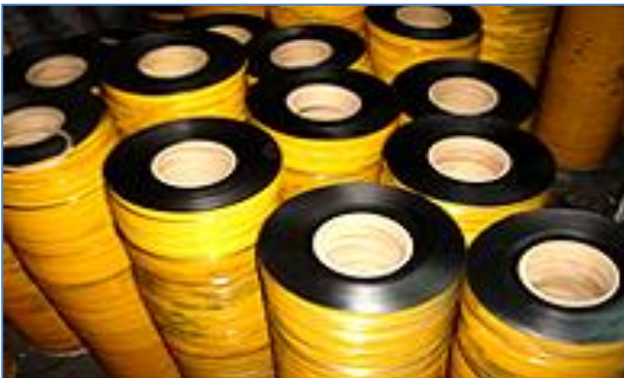
Flexible Graphite Tape