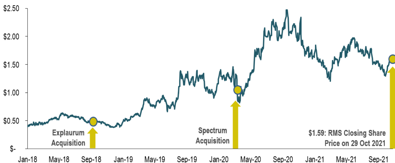
Figure 2: Ramelius recent acquisitions 5 and share price performance

Ramelius has successfully undertaken the acquisitions of Explaurum Limited and Spectrum Metals Limited in recent years (each via takeover offer), providing a mix of cash and shares to target shareholders in each case. As demonstrated in Figure 2, the returns realised by target shareholders who received Ramelius shares and have retained those shares, in each case, have been outstanding, with all Ramelius shareholders benefiting from the value creation achieved by the company since undertaking those acquisitions.