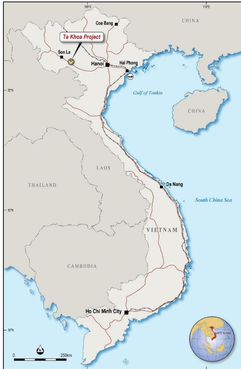
Figure 2. Ta Khoa Nickel-Cu-PGE Project Location

By combining the Company's existing mineral inventory (Ban Phuc Disseminated Sulfide - DSS), exploration potential presented by high priority targets such as Ban Chang, King Snake, Ta Cuong and Ban Khoa, and the ability to source third party concentrate, Blackstone will be able to increase the scale of its downstream business to cater to the rising demand for downstream nickel products.