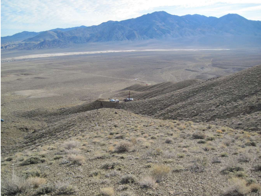
Figure 2: Landscape at Douglas Canyon Gold Project, Nevada, with drill rig in the mid-distance