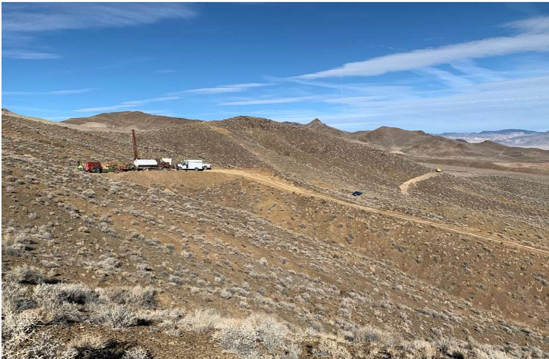
Figure 3: Drill rig on-site at Douglas Canyon Gold Project, Nevada