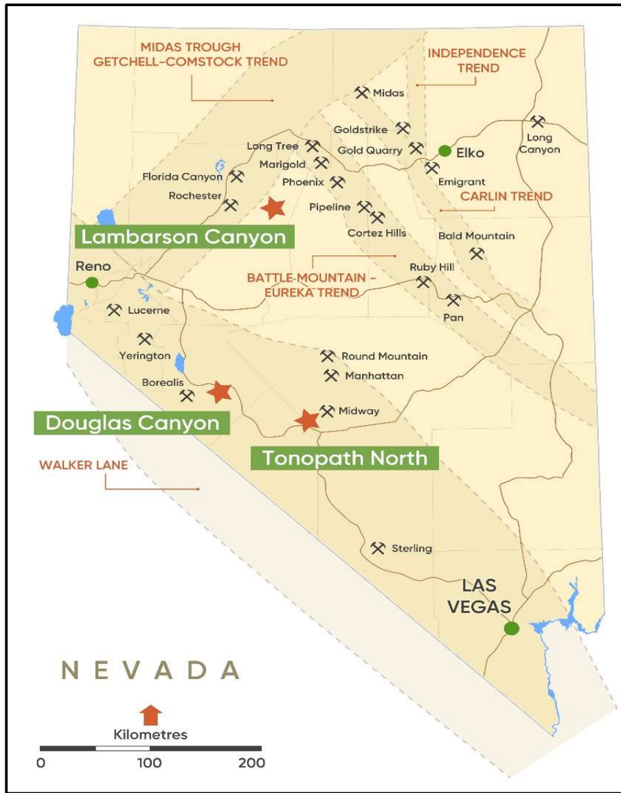
Figure 1: Nevada Projects Locations, with regional mines and reported historic and current resources & reserves ii

The program is expected to be completed in the current month, and results will be released as they become available.