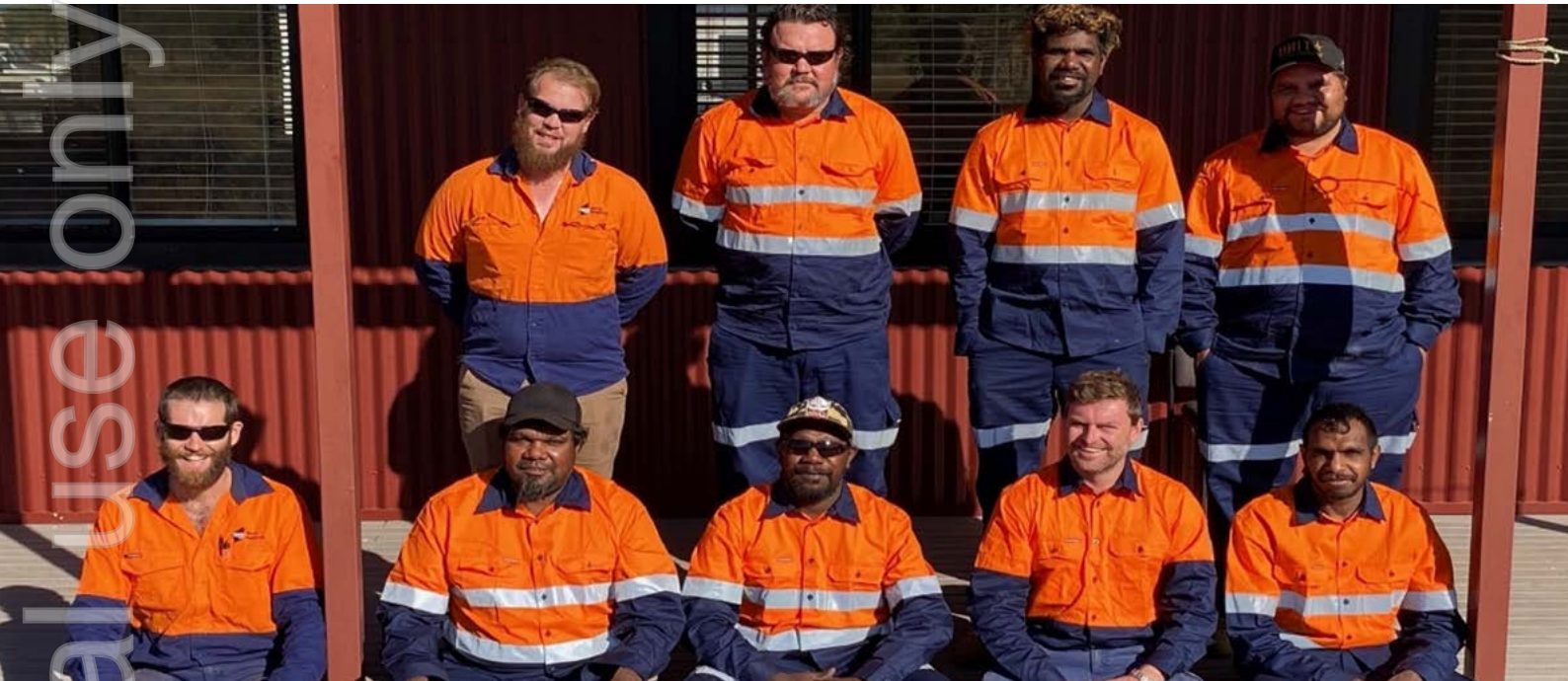
Figure 4: The trainers and graduates of the Training to Work Program

All six students successfully completed the program and celebrated their achievement with a graduation ceremony attended by their families and community. All students were offered employment with either Northern Minerals or our Contractors.