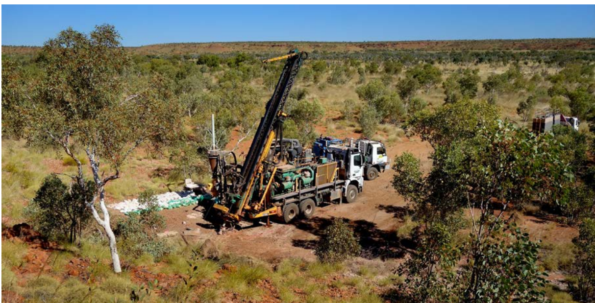
Figure 1: RC Drilling at Rockslider