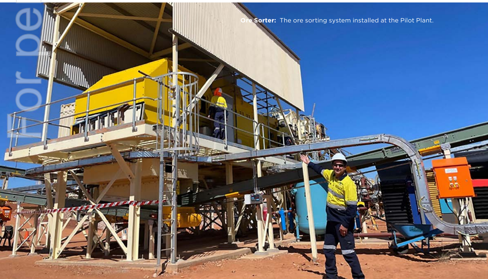
Ore Sorter: The ore sorting system installed at the Pilot Plant.

Initial sorting tests of the Banshee ore have shown that the highly oxidised surface material contains a large fines fraction and that the grade of the sortable fraction (i.e. >10mm) can be doubled recovering more than 60% of the TREO in 25% of the mass. An additional bulk sample has been extracted from deeper in the costean and three diamond drill holes have been drilled for further test work.