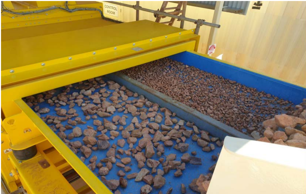
Figure 3: Feeder with simultaneous feed of two size fractions of ore to the ore sorter machine

During the quarter the Company expended approximately $1.0 million on exploration and evaluation activities.