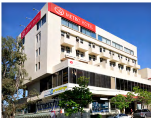
Metro Hotel Miranda Cnr Kingsway & Jackson Avenue, Miranda Sydney, NSW 2228 T: 61 2 9525 7577