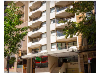
Metro Apartments on King 27-29 King Street Darling Harbour, Sydney NSW 2000 T: 61 2 9290 9200