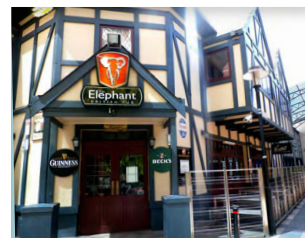
The Elephant British Pub 1 Cinema Place Adelaide SA 5000 T: 61 8 8227 1633