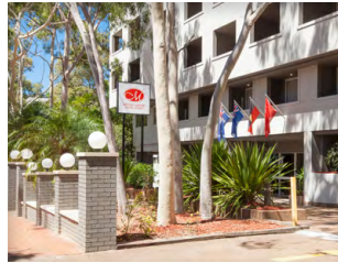
Metro Aspire Hotel Sydney 383-389 Bulwara Road Ultimo, Sydney NSW 2007 T: 61 2 9211 1499