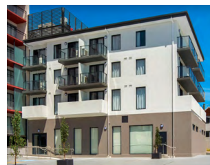
Metro Hotel Perth 61 Canning Highway South Perth WA 6151 T: 61 8 9367 6122