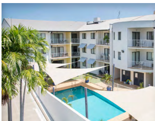
Metro Advance Apartments & Hotel Darwin 55 Cavenagh Street Darwin, NT 0800 T: 61 08 7979 2222