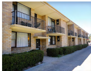
Metro Inn Ryde 860 Victoria Road Ryde, Sydney NSW 2112 T: 61 2 9807 4022