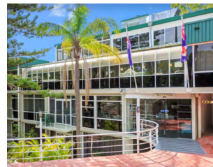
Metro Mirage Hotel Newport 2 Queens Parade West Newport, Sydney, NSW 2106 T: 61 2 9997 7011