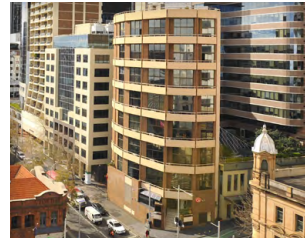
Metro Apartments Darling Harbour 132-136 Sussex Street Darling Harbour, Sydney NSW 2000 T: 61 2 9290 9200