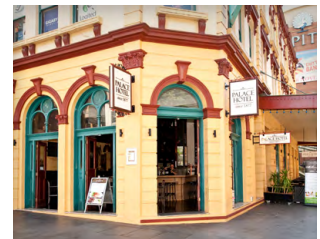
Palace Hotel since 1877 730 George Street Sydney NSW 2000 T: 61 2 9212 2111