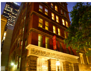
Metro Apartments on Bank Place 18 Bank Place Melbourne VIC 3000 T: 61 3 9604 4321