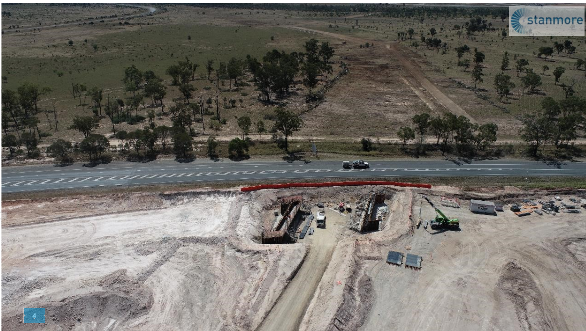
Figure 2: Construction of the concrete underpass bridge next to the Peak Downs Highway