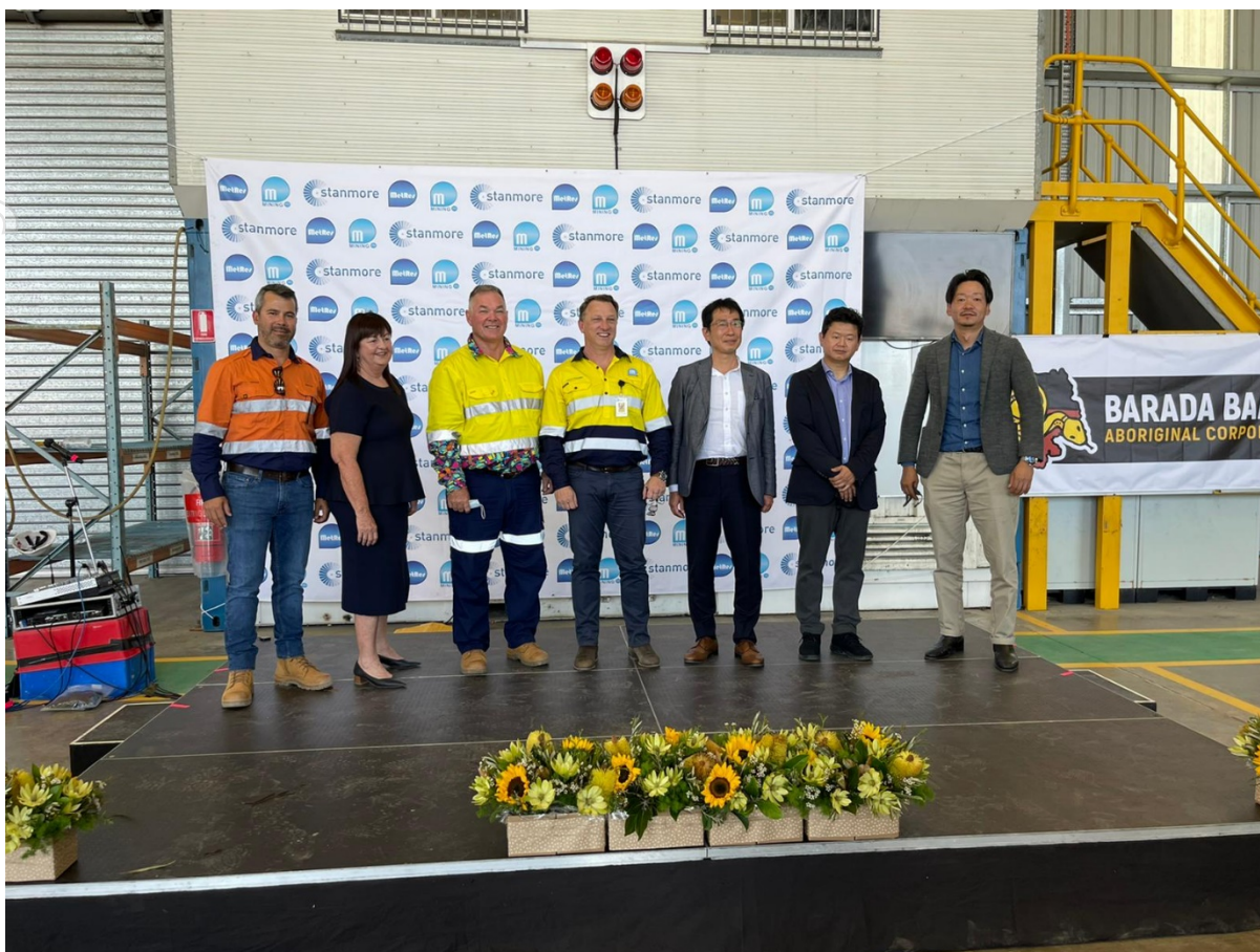
Figure 4: Opening day at Millennium and Mavis Downs mine