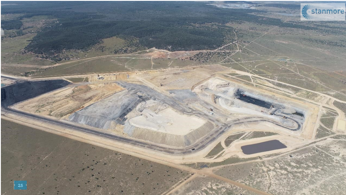
Figure 1: Isaac Downs bulk sample pit, ROM stockpile on the left, and Millennium mine in the far background

The bulk sample pit for the purposes of providing trial cargoes to key customers has been successful with no material coal quality issues raised by key customers.