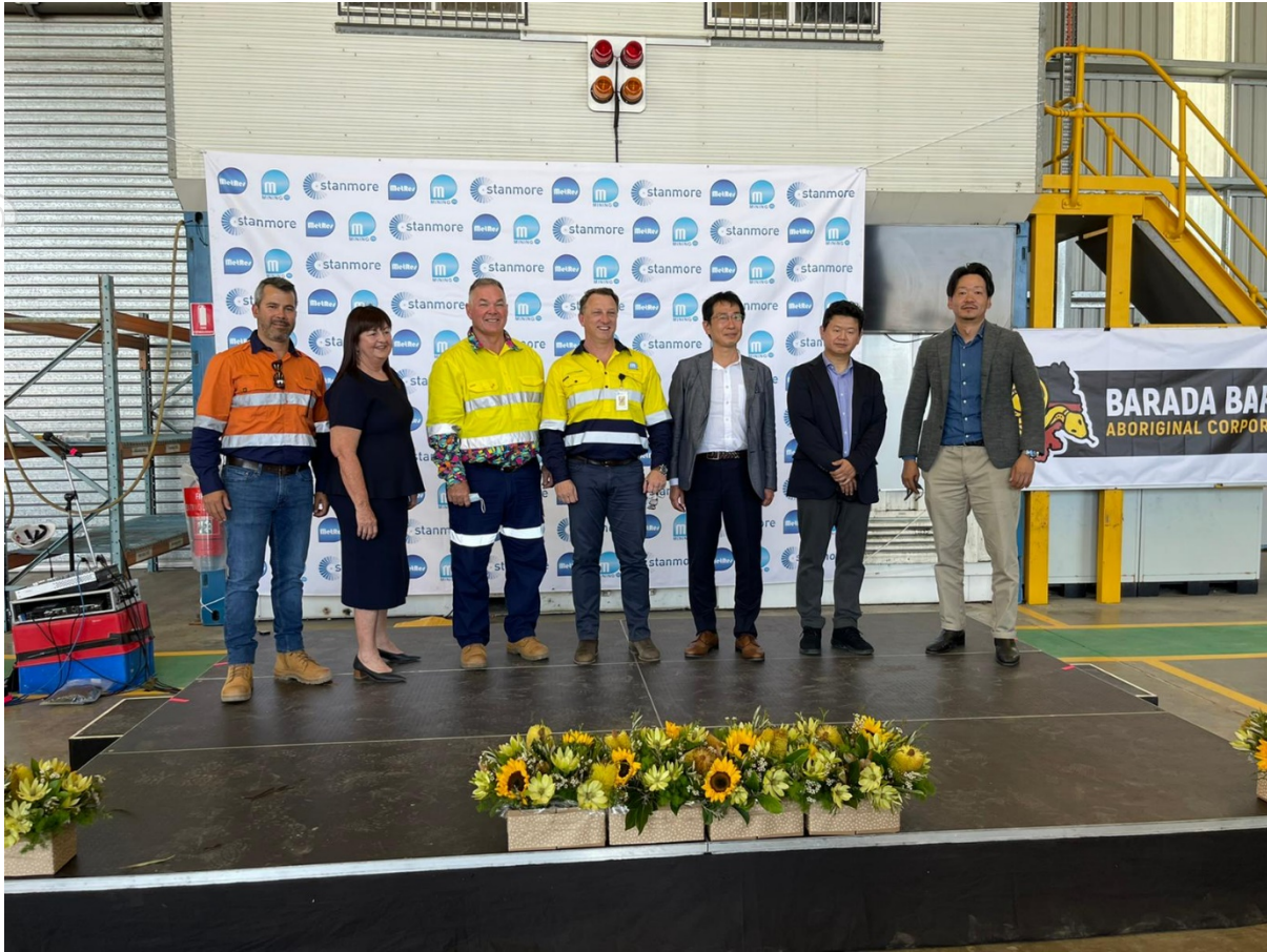
Figure 4: Opening day at Millennium and Mavis Downs mine