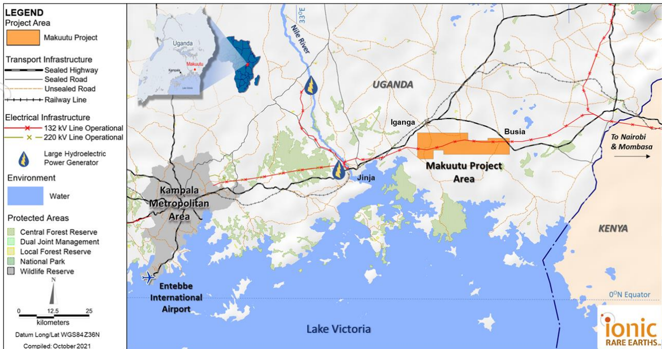
Figure 2: Makuutu Rare Earths Project Location with major existing infrastructure.