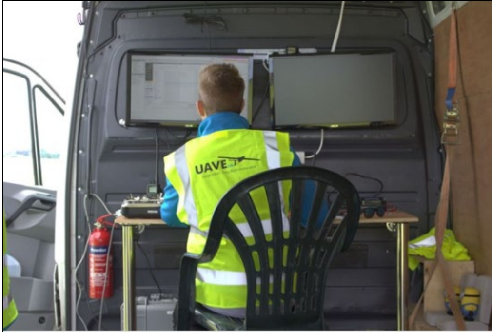
Figure 4: The UAVE team monitoring surveying from the mobile flight centre.

identified in the region. This will refine target areas of interest for ground exploration, underpinning the Company's objective of creating a "pipeline" of prospects to evaluate, and if warranted, advance towards initial drilling.