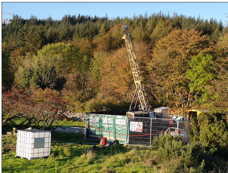
Figure 1: Photo of the drill rig set up on the first hole.

Planned drill holes between 150 and 300m in length will target mineralisation beneath the old workings (mined from surface commonly to a depth of approximately 45m). Holes will cover approximately 1km of strike extent of the potential 4.5km mineralised trend.