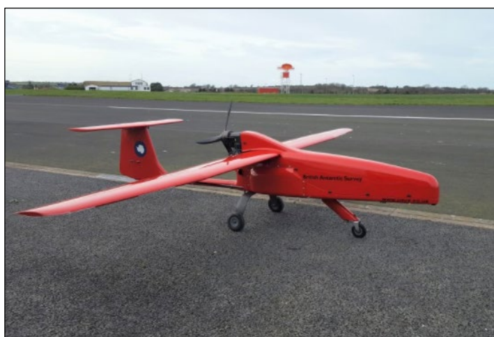
Figure 3: The Prion Mk3 drone used for the magnetic survey

The survey will be conducted by UAVE Ltd using the Prion Mk3 UAV, a purpose built fixed-wing drone with a nose mounted Geometric G-832A sensor, flown at approximately 100m above surface using a 200m x 500m survey grid spacing for more than 2,000 flown line kilometres.