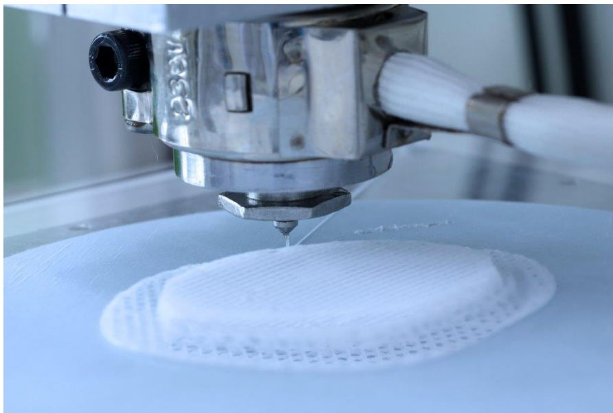
Figure 2: Osteopore's 3D Printed Bioresorbable Lattice

The cranium is a highly complex shape, and the Company is very excited to be collaborating with Osteopore and their cutting-edge bioresorbable 3D printed lattice that not only uses 3D printing to generate the complex shapes required, but also enables regenerative bone growth.