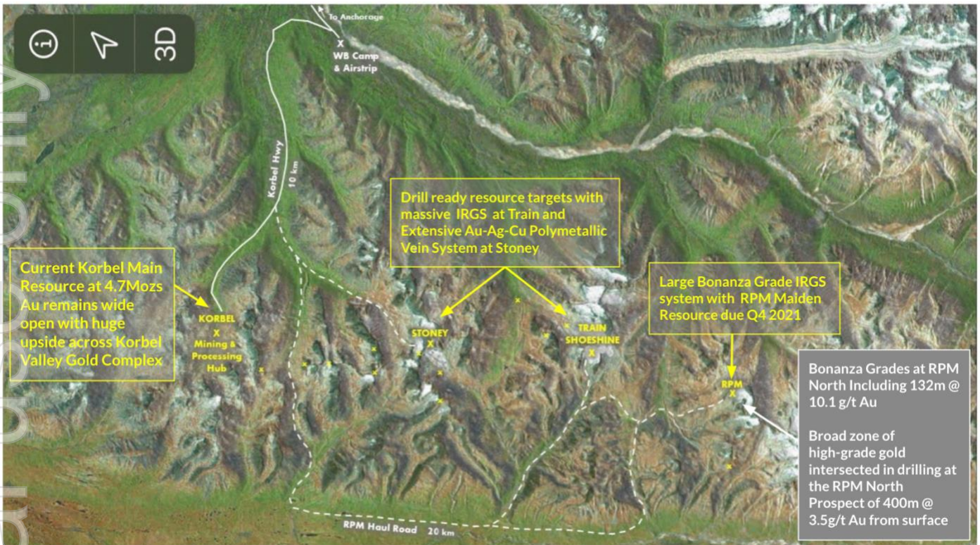
Figure 3. Visualising The Estelle Gold District - Unlocked