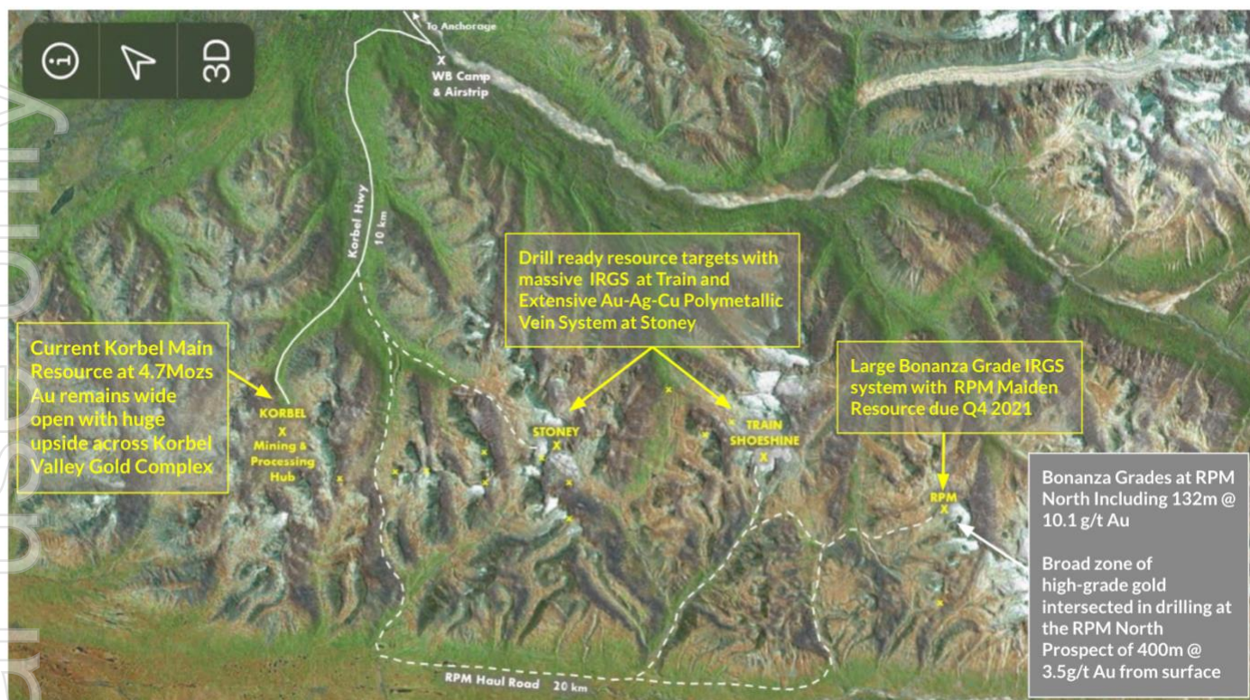
Figure 3. Visualising The Estelle Gold District - Unlocked