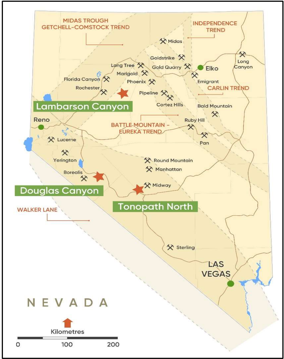
Figure 1: Nevada Projects Locations, with regional mines and reported historic and current resources & reserves ii