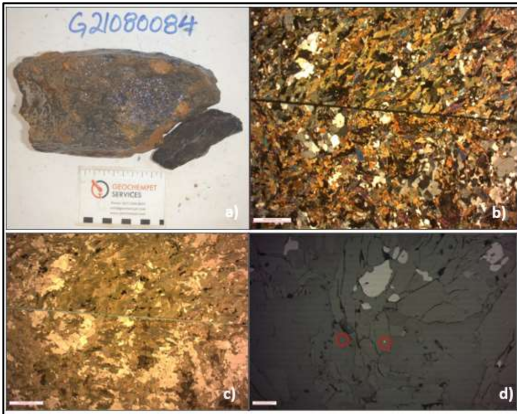
Figure 1. a) Photograph of the supplied rock sample collected during Phase I sampling of the Crown Project ; b) Low magnification, transmitted cross polarised light image of part of amphibolite showing common hornblende, feldspar which is partly sericitized and quartz and opaques; c) Micrograph of same view (b), taken at low magnification in plane transmitted light; d) Low magnification, transmitted plane light image of amphibolite fragment showing bright white magnetite grains with minor light grey ilmenite inclusions and a few yellowish specks of sulphide pyrite/ chalcopyrite (circled in red) overprinting the matrix. Assay results Pending.

The Crown Project contains numerous magnetic features interpreted to represent mafic volcanic rocks considered to be highly prospective for similar Ni-Cu-PGE and gold mineralisation, and the initial findings from the fieldwork program – identifying the presence of copper sulphides in what are interpreted to be ultramafic rocks – are significant positive indicators of the Project’s prospectivity.