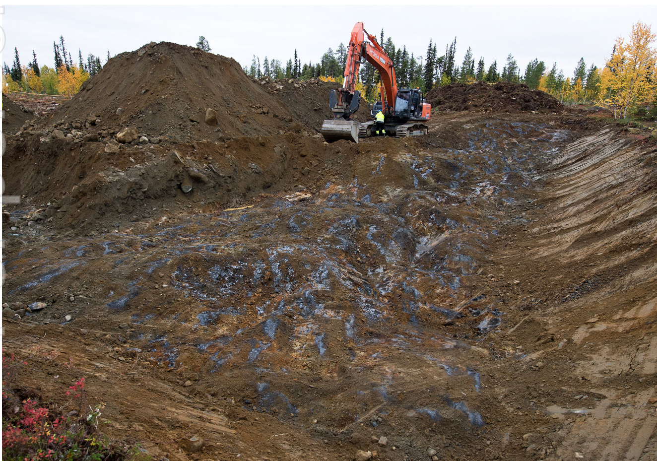
Figure 1 Overburden clearing at trial mine site reveals visible high grade graphite near surface.

Site works include the installation of environmental monitoring systems, such as dust sampling and water treatment equipment, and fencing as well as roadworks and overburden removal with stockpiling of topsoil for rehabilitation of the 100m x 100m site at the end of the 2021 Campaign.