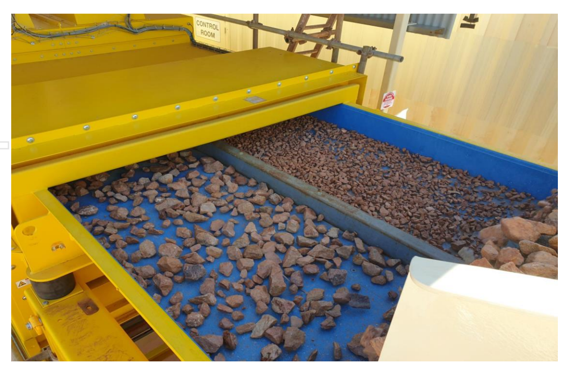
Figure 2: Feeder with simultaneous feed of two size fractions of ore to the ore sorter machine

The sorter has been run over two test campaigns which included 41 test runs processing 5,300 tonnes of ore from the ROM stockpiles largely coming from Wolverine ore, and 5 test runs on Banshee ore that was bulk sampled from a surface costean that provided 285 tonnes of Banshee ore.