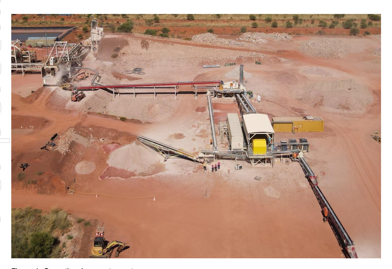
Figure 1: Operational ore sorter system