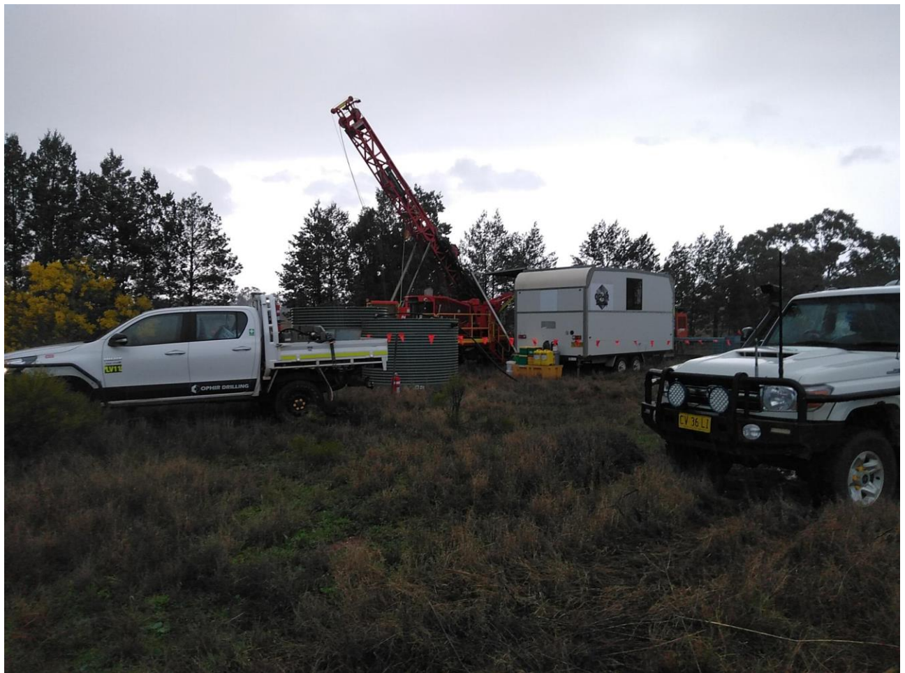
Drilling hole TOD001 at the Orange Plains Deposit

A summary location figure for drilling at the Carolina Deposit is presented below. Drilling is envisaged to take 6 weeks with a further 6 to 8 week lag for assay results.