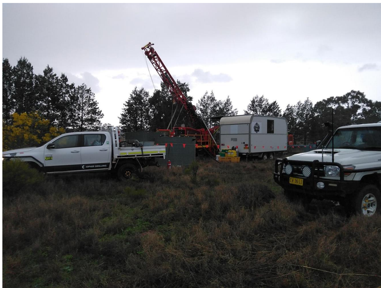
Drilling hole TOD001 at the Orange Plains Deposit

A summary location figure for drilling at the Carolina Deposit is presented below. Drilling is envisaged to take 6 weeks with a further 6 to 8 week lag for assay results.