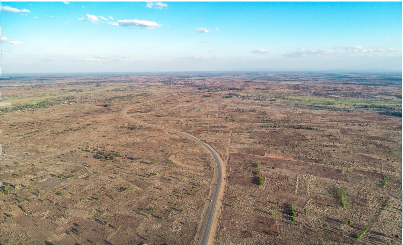
Figure 3. Drone image at the Nsaru area showing typical flat and open landscape of central Malawi.