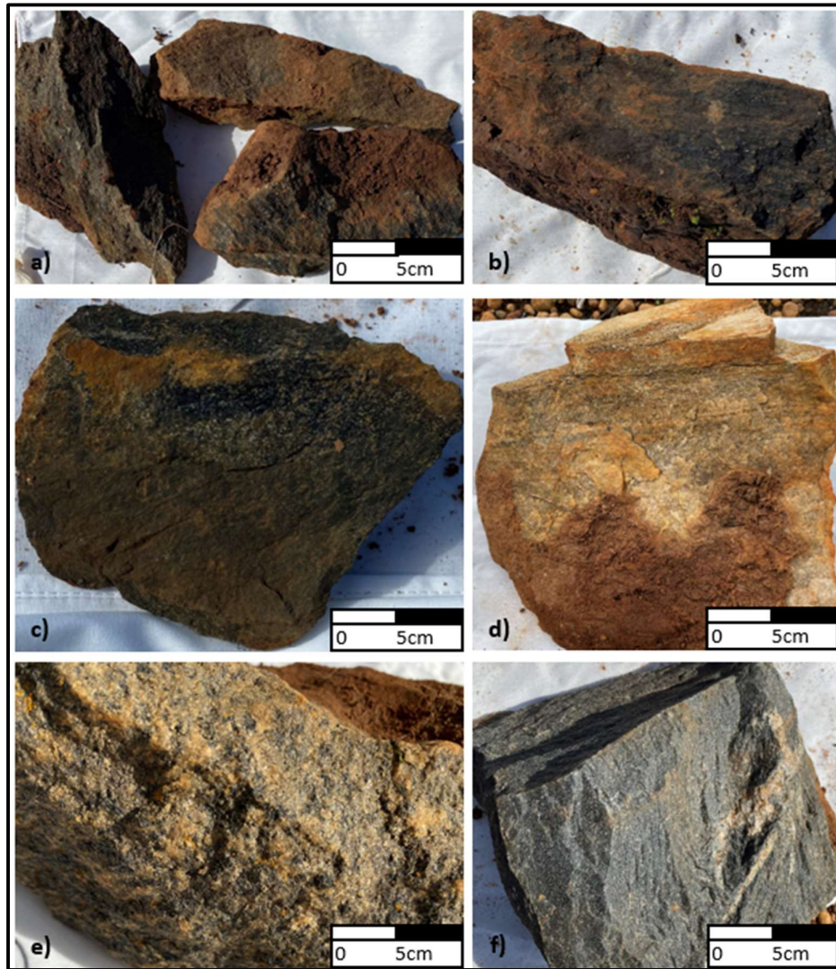
Figure 2. Selected rock samples collected at various locations at the Crown Project.

A second phase of mapping and rock chip sampling will commence in the coming days and will be followed up by systematic geochemical soil sampling designed to define and refine drill targets ahead of a proposed maiden drilling program.