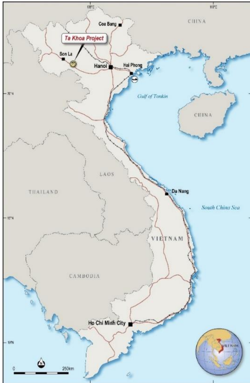
Figure 2. Ta Khoa Nickel-Cu-PGE Project Location

By combining the Company's existing mineral inventory (Ban Phuc Disseminated Sulfide - DSS), exploration potential presented by high priority targets such as Ban Chang, King Snake and Ta Cuong, and the ability to source third party concentrate, Blackstone will be able to increase the scale of its downstream business to cater to the rising demand for downstream nickel products.