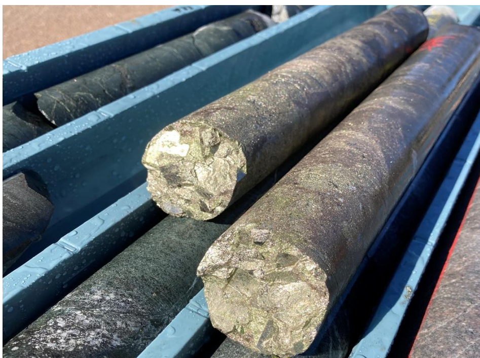
Massive sulphide core from ULG-21-022 prior to assaying