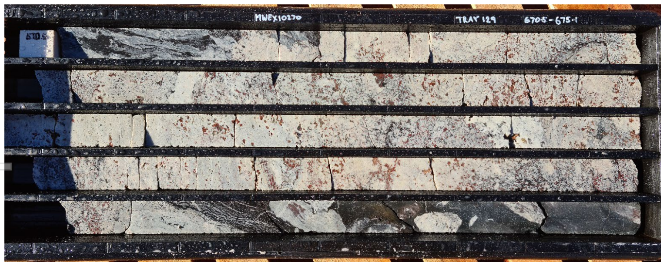
Figure 5 Brick red coloured coarse grained disseminated REE mineralisation in carbonatite, half split drill core. 670.5m to 675.1m drill depth