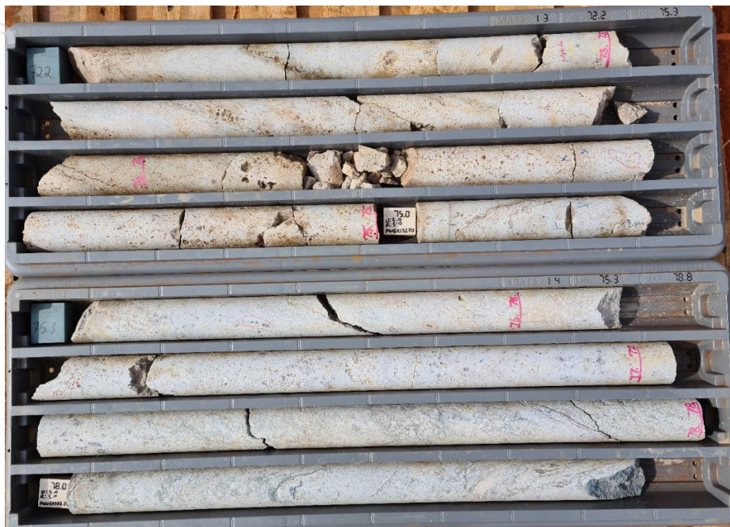
Figure 3 Carbonatite with stylolite joints and vugs. Fine grained disseminated rare earth minerals visible under hand lens. Low level of chlorite alteration from 77.10m onwards.