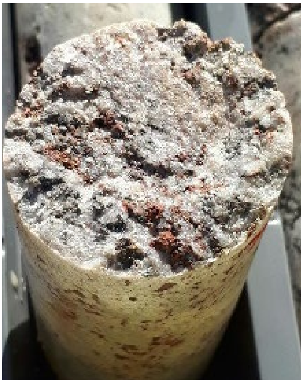
Figure 4 Brick red coloured coarse grained REE minerals at 748m depth