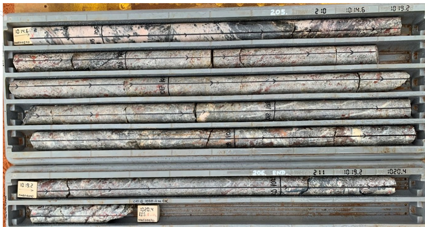
Figure 3 MWEX10270 Drillhole ending at 1020.4m depth in REE mineralisation