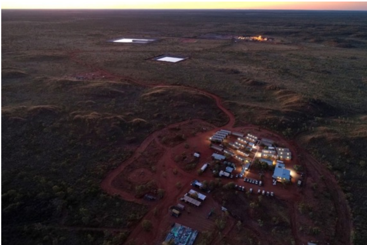
Figure 1: Sunset at Browns Range