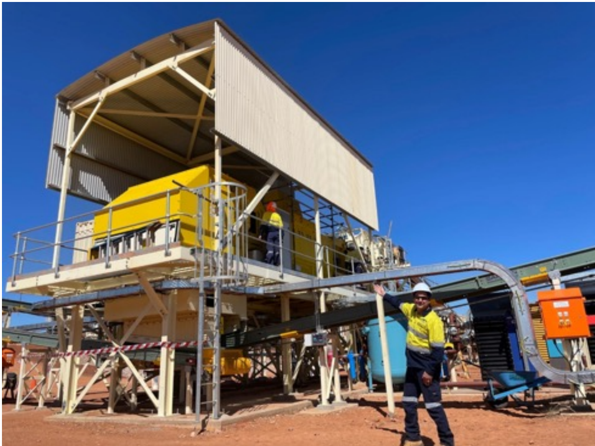
Figure 2: CEO Mark Tory on site inspecting the now commissioned ore sorting system.

During the quarter the Company expended approximately $1.8 million on production and development activities.