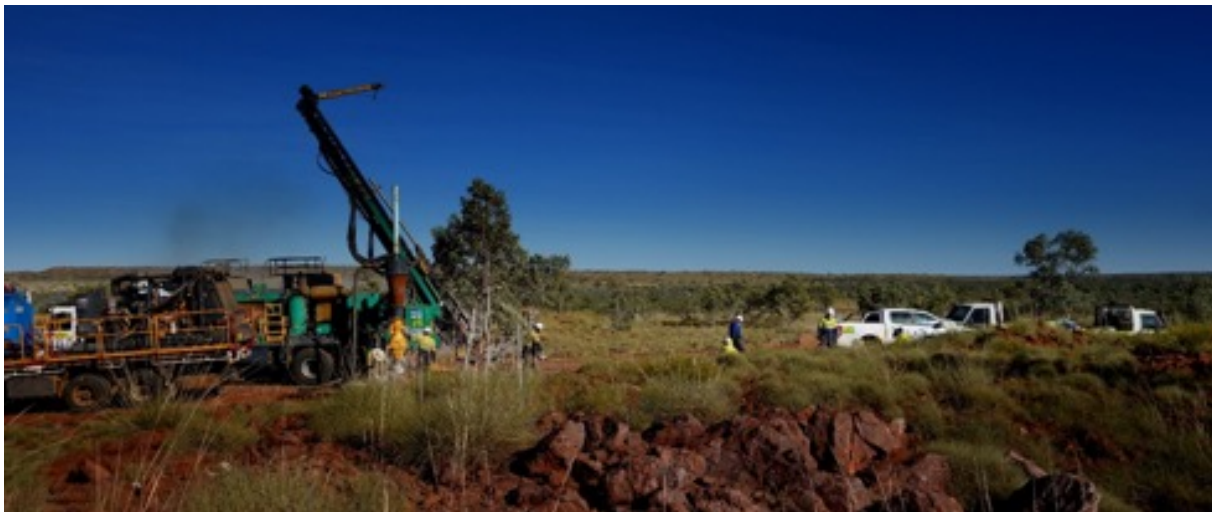
Figure 3 - Initial results from the second phase RC drilling are expected at end of the September quarter, pending laboratory capacity.

Combined results from the 2020-21 RC drilling campaigns will support the scope of the current feasibility work for the commercial-scale beneficiation plant.